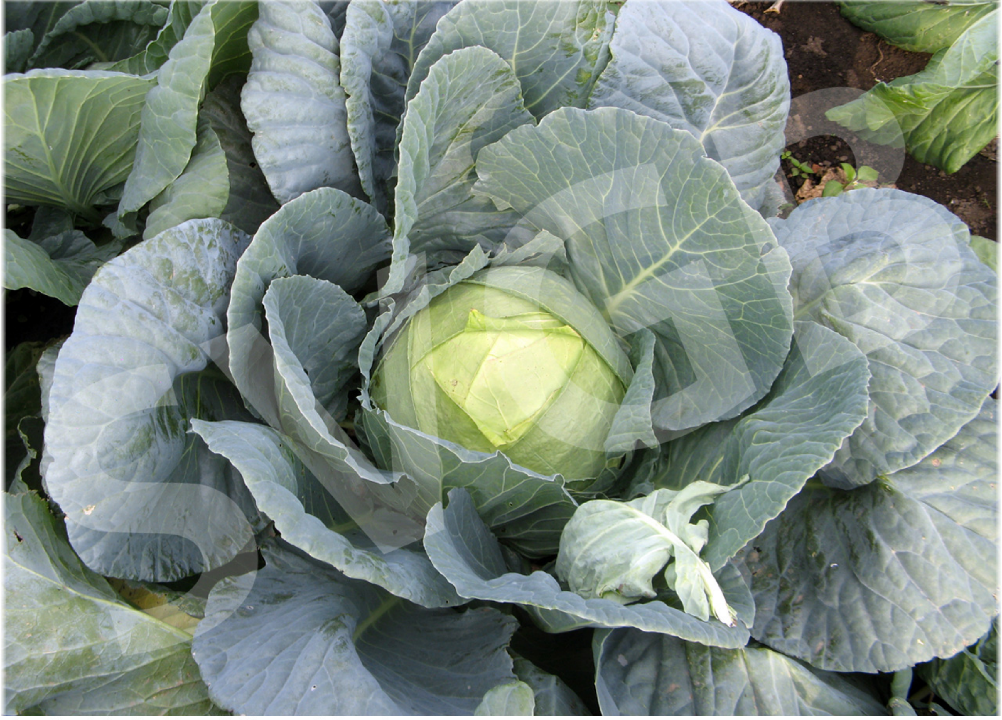
Local variety of cabbage in Vorona, Botoşani