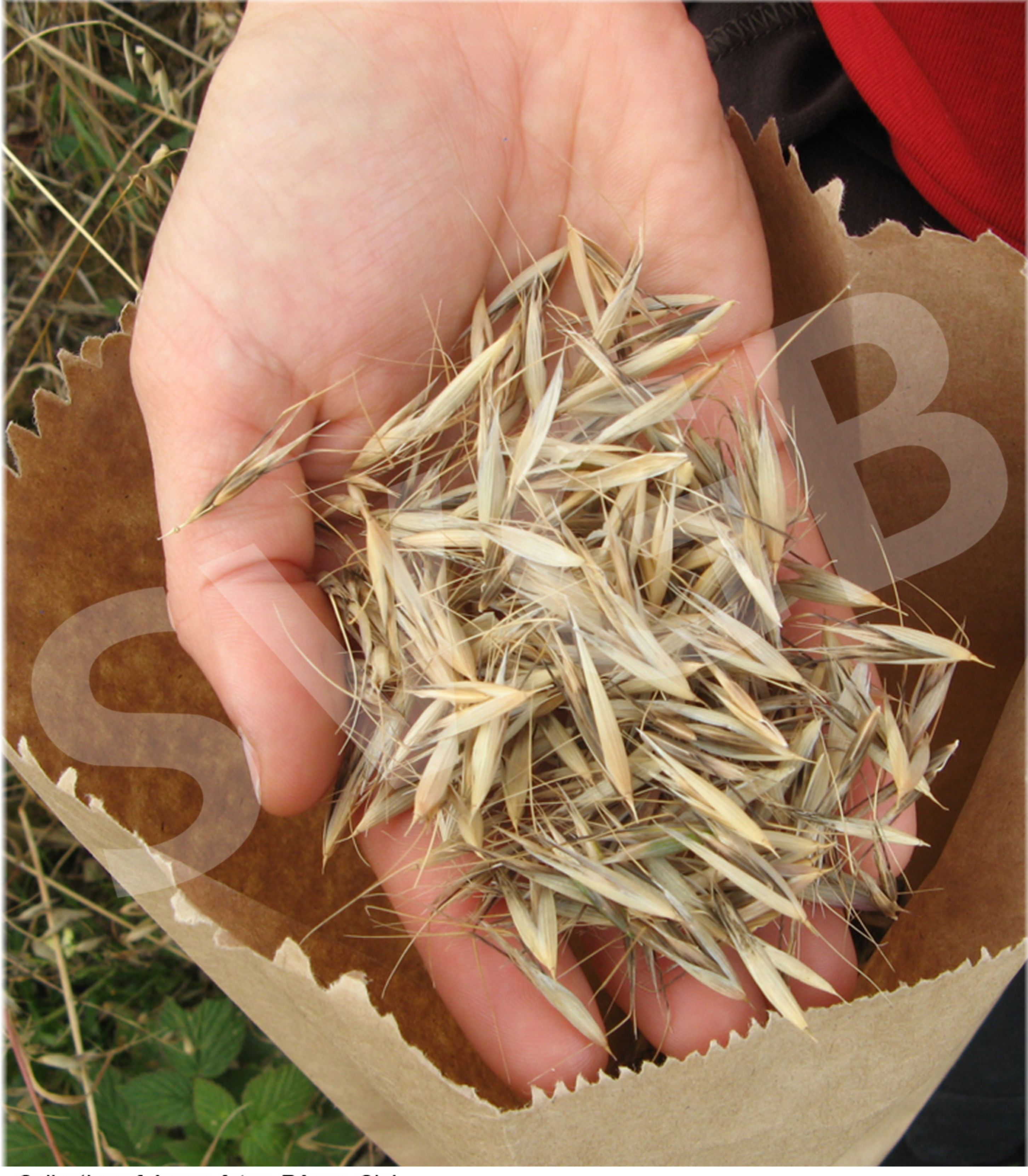
Collecting of Avena fatua, Râşca, Cluj