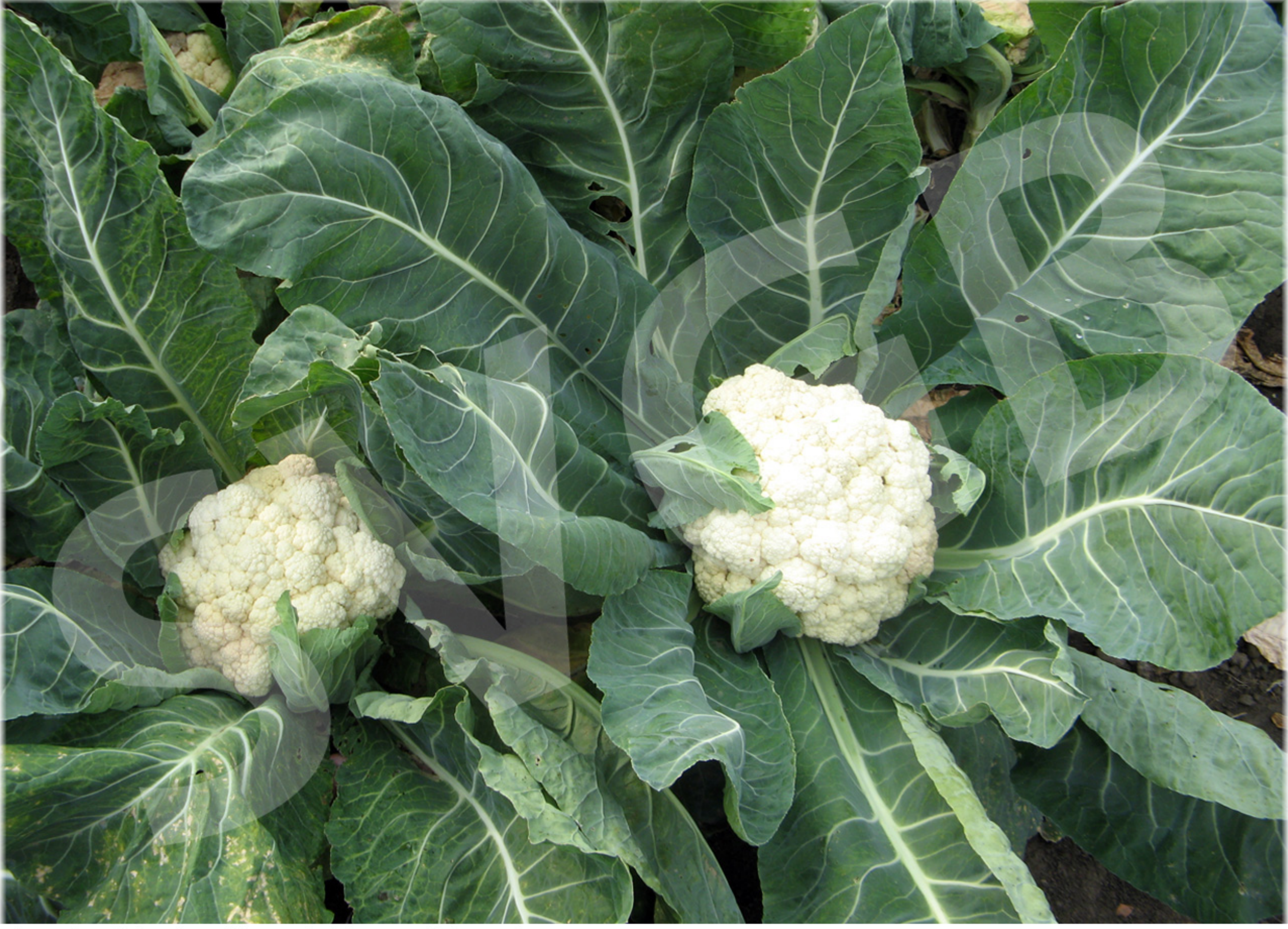
Local variety of cauliflower in Vorona, Botoşani