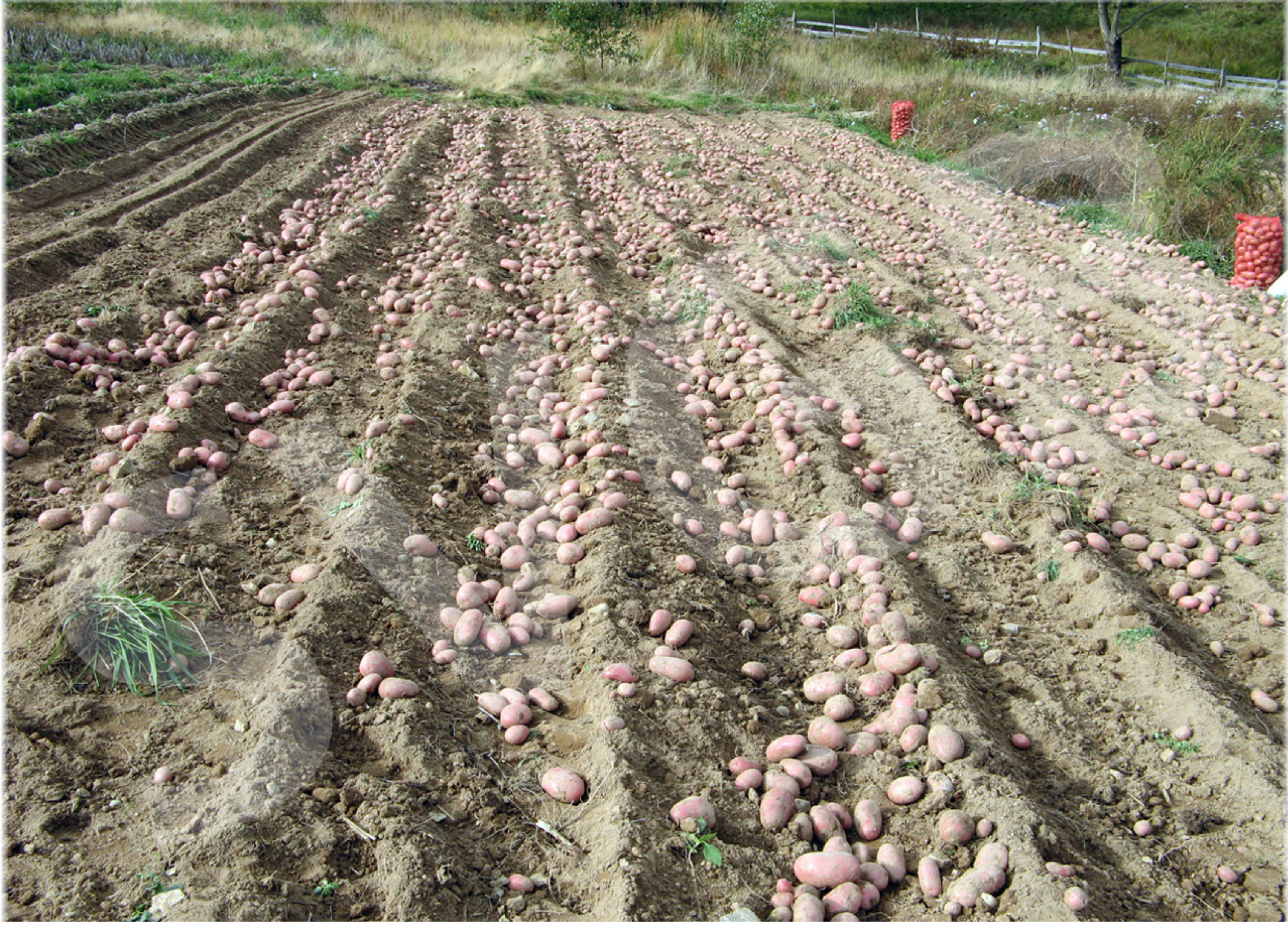
At potato harvesting in Râşca, Cluj