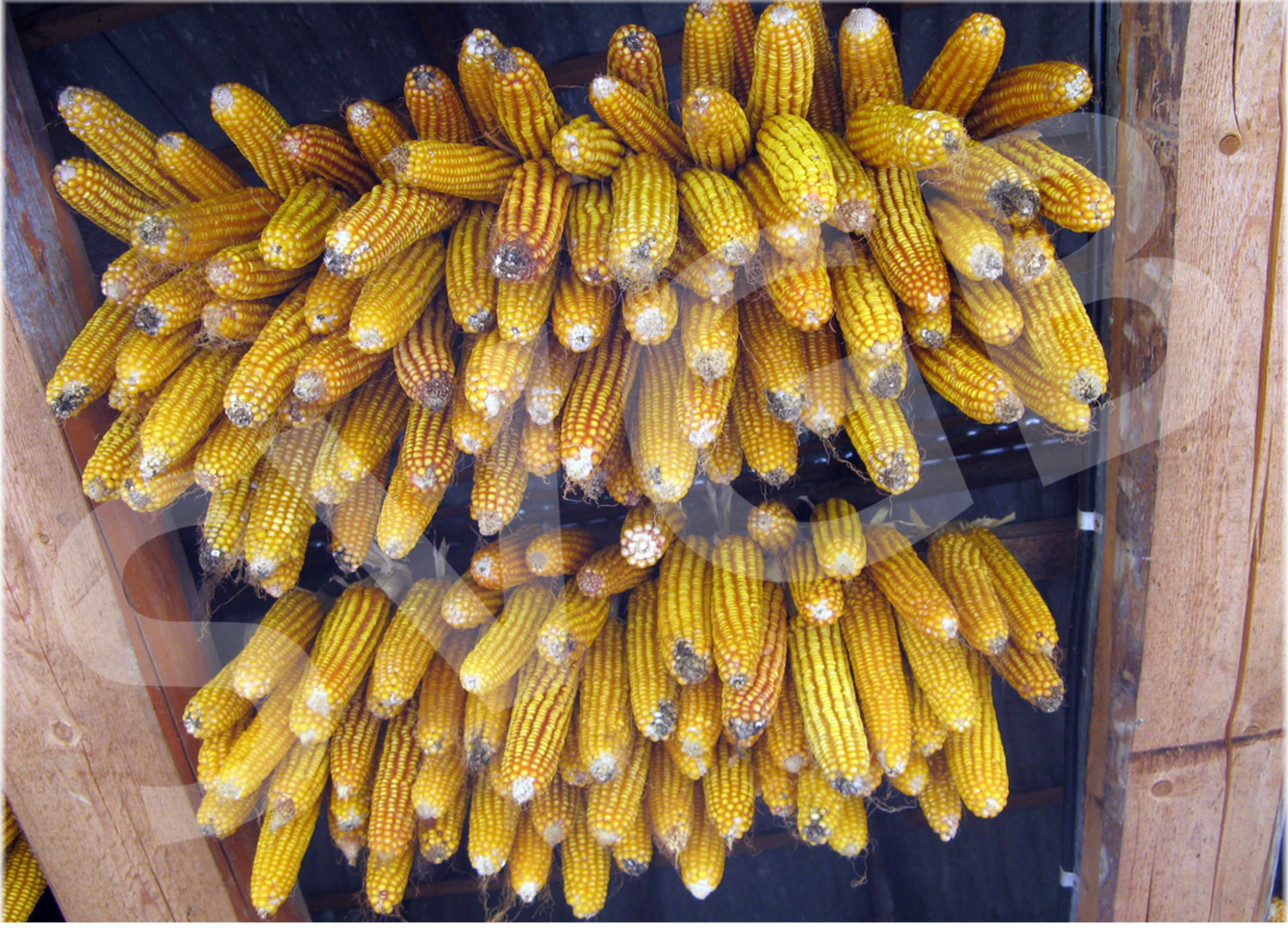
Local variety of maize in an attic