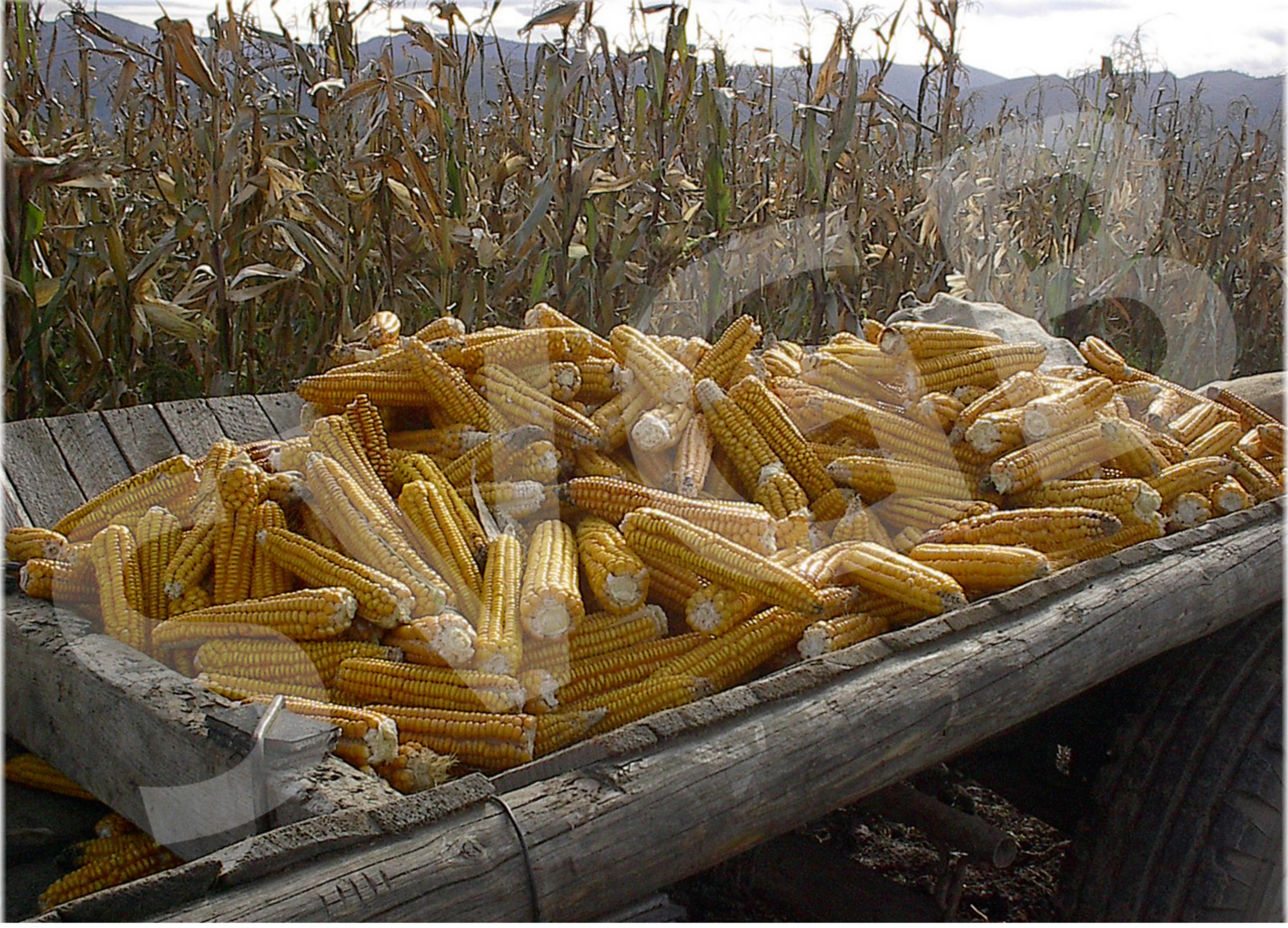
Maize harvesting in Gura Văii, Braşov