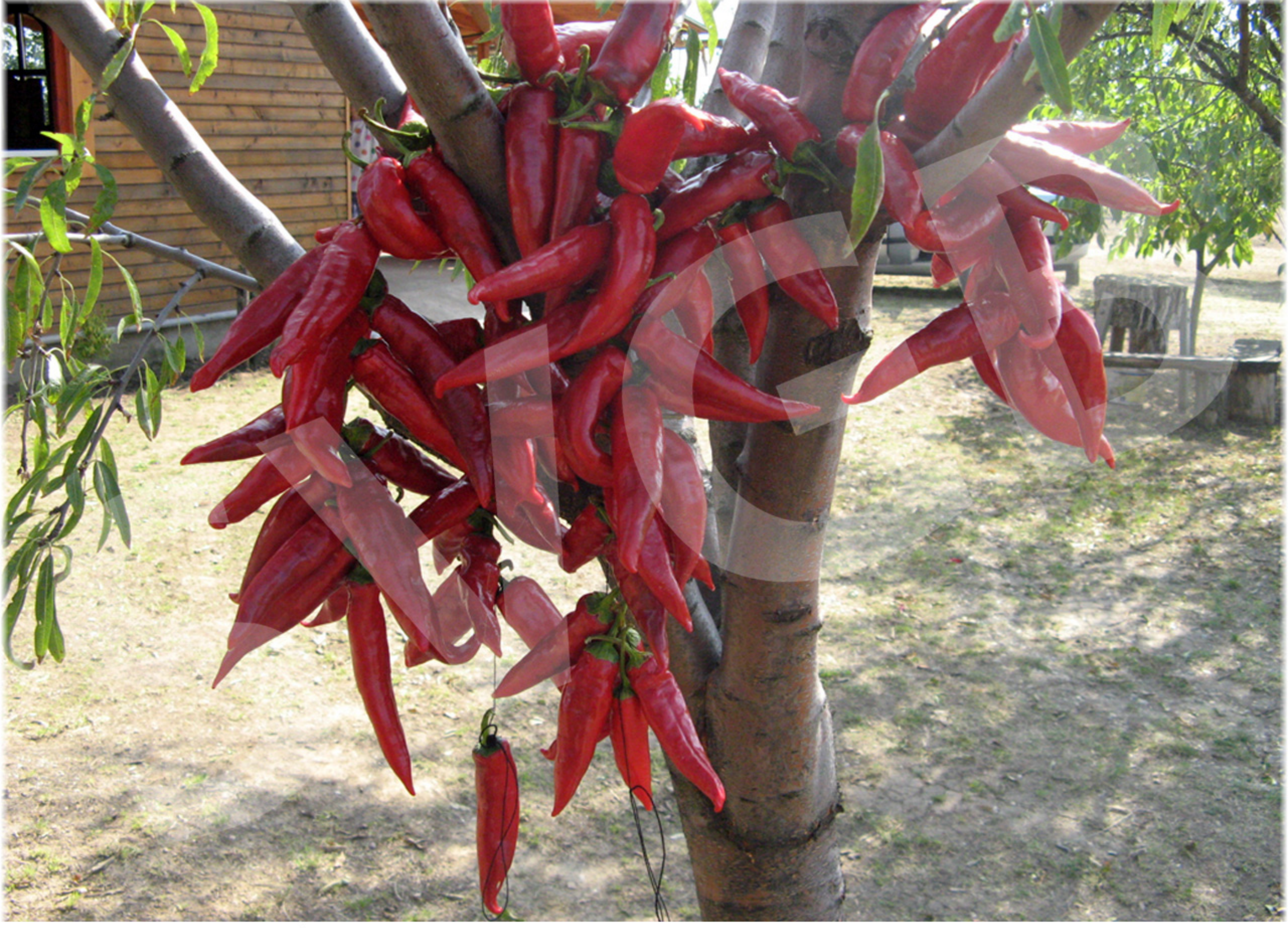
Braided red chilies in Palotas, Ungaria