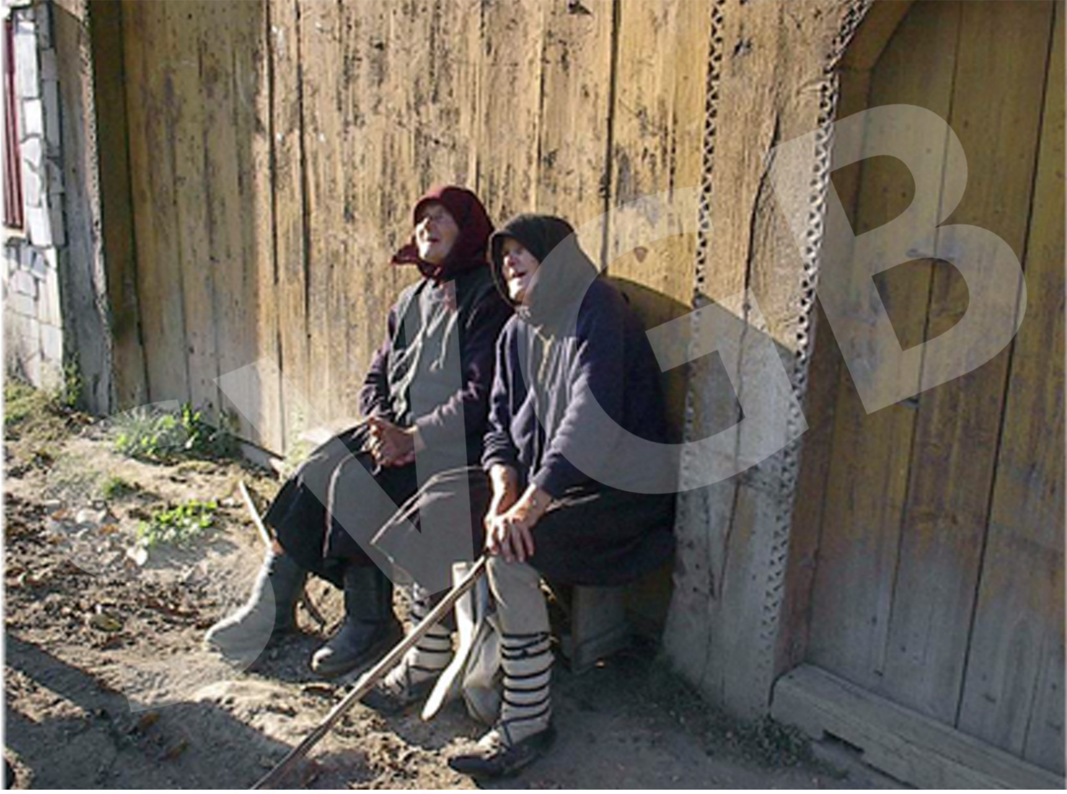
Keepers of traditional agriculture, Maramureş (2)