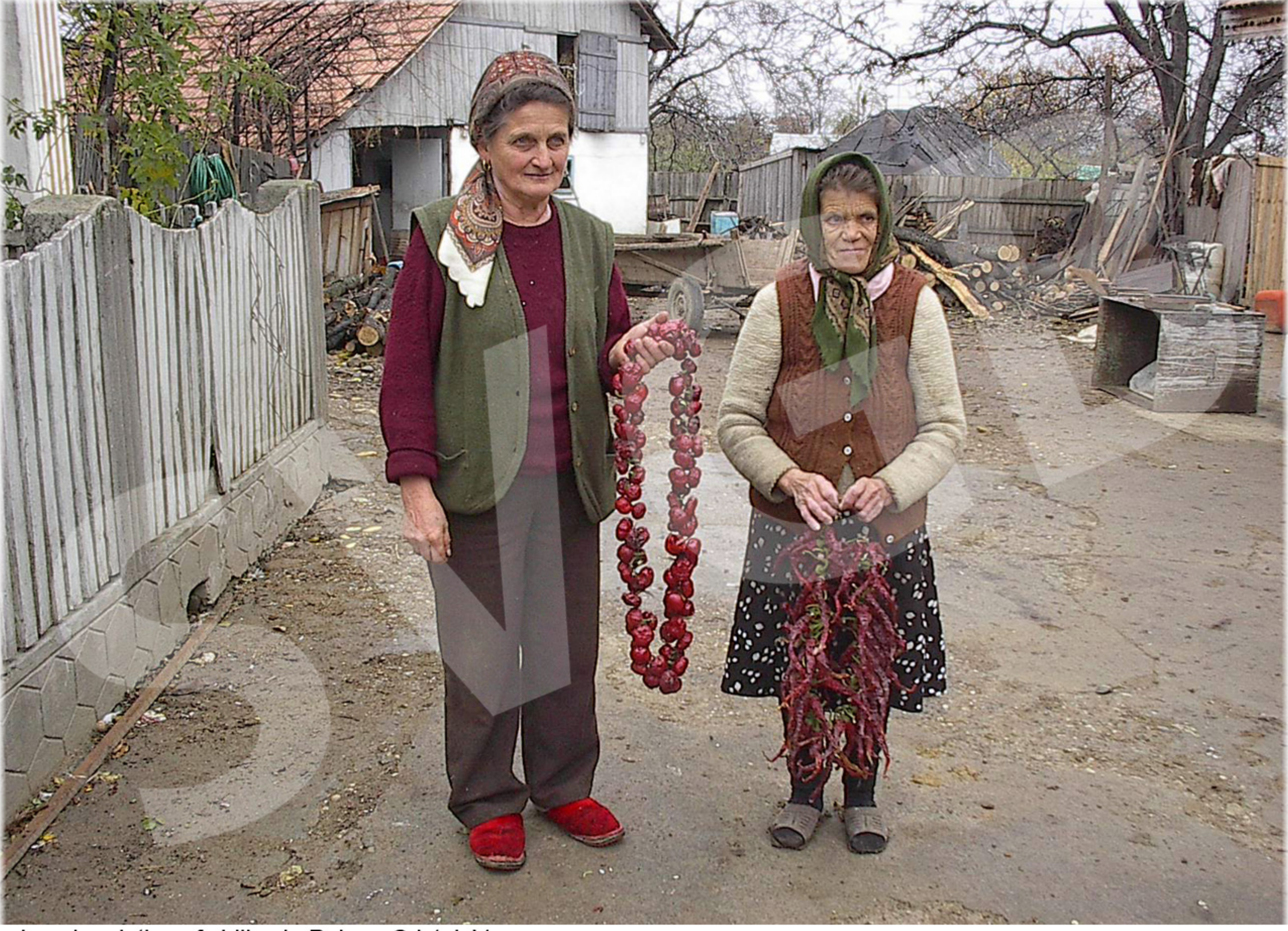
Local varieties of chilies in Poiana Cristei, Vrancea