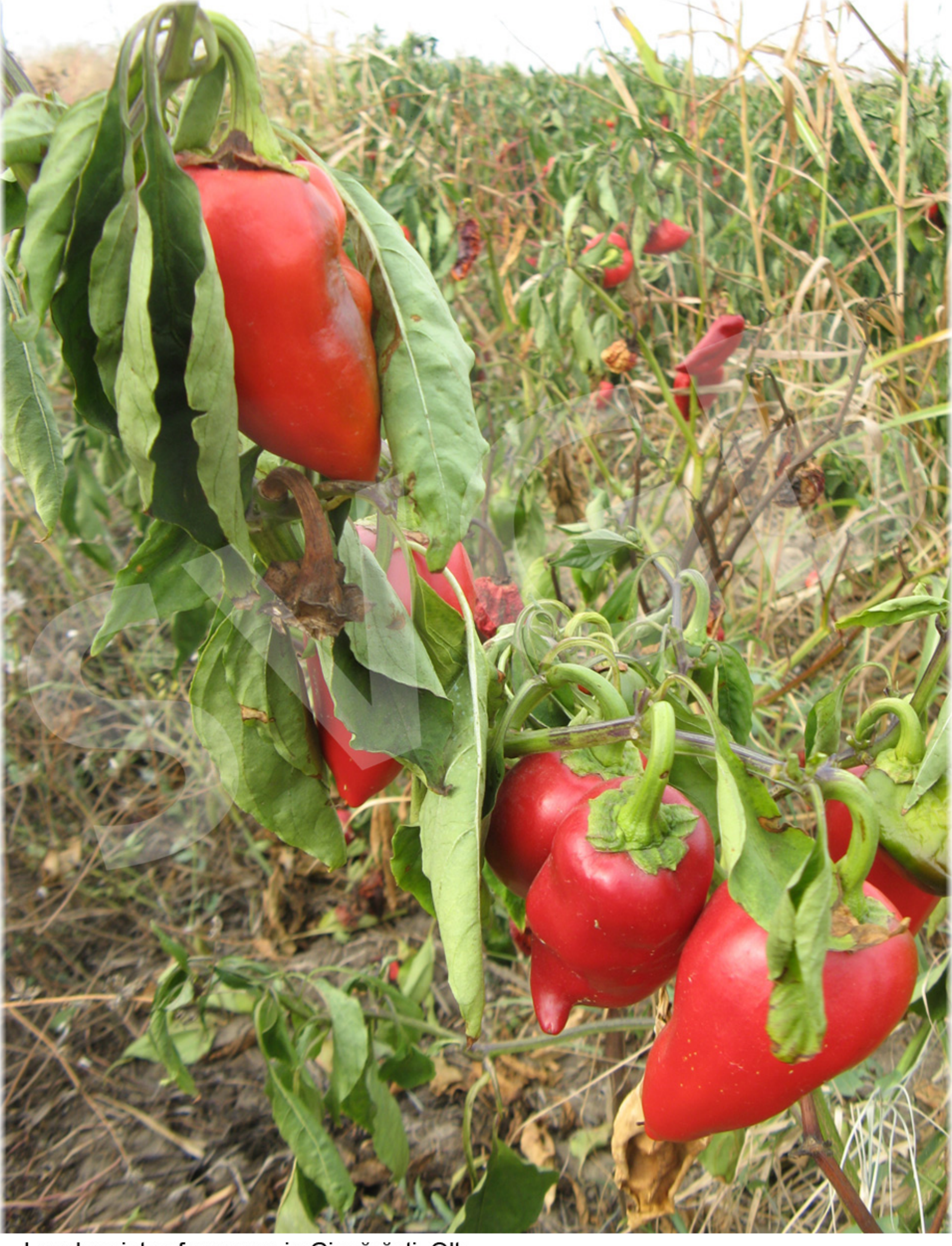
Local variety of peppers in Giuvărăşti, Olt