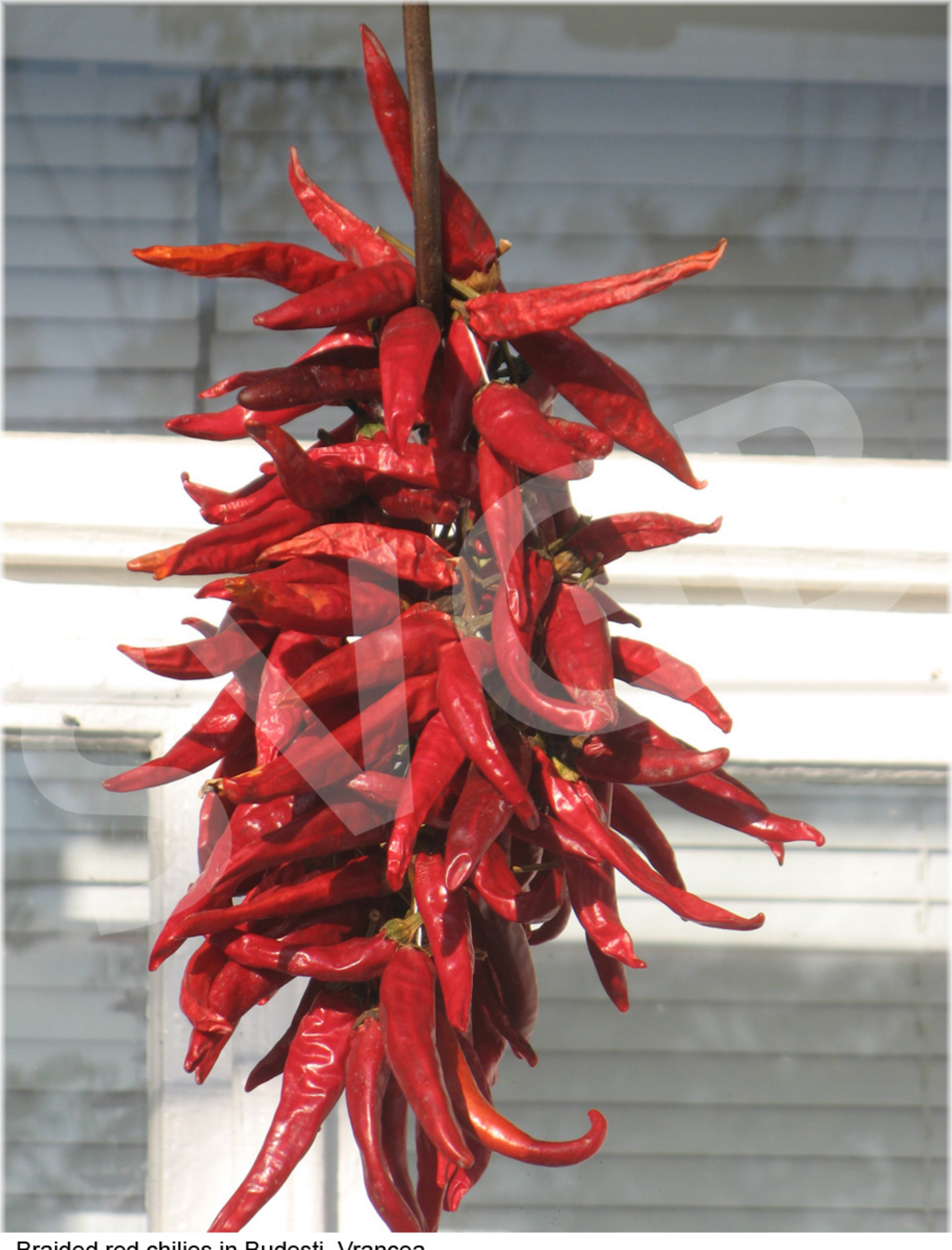
Braided red chilies in Budeşti, Vrancea