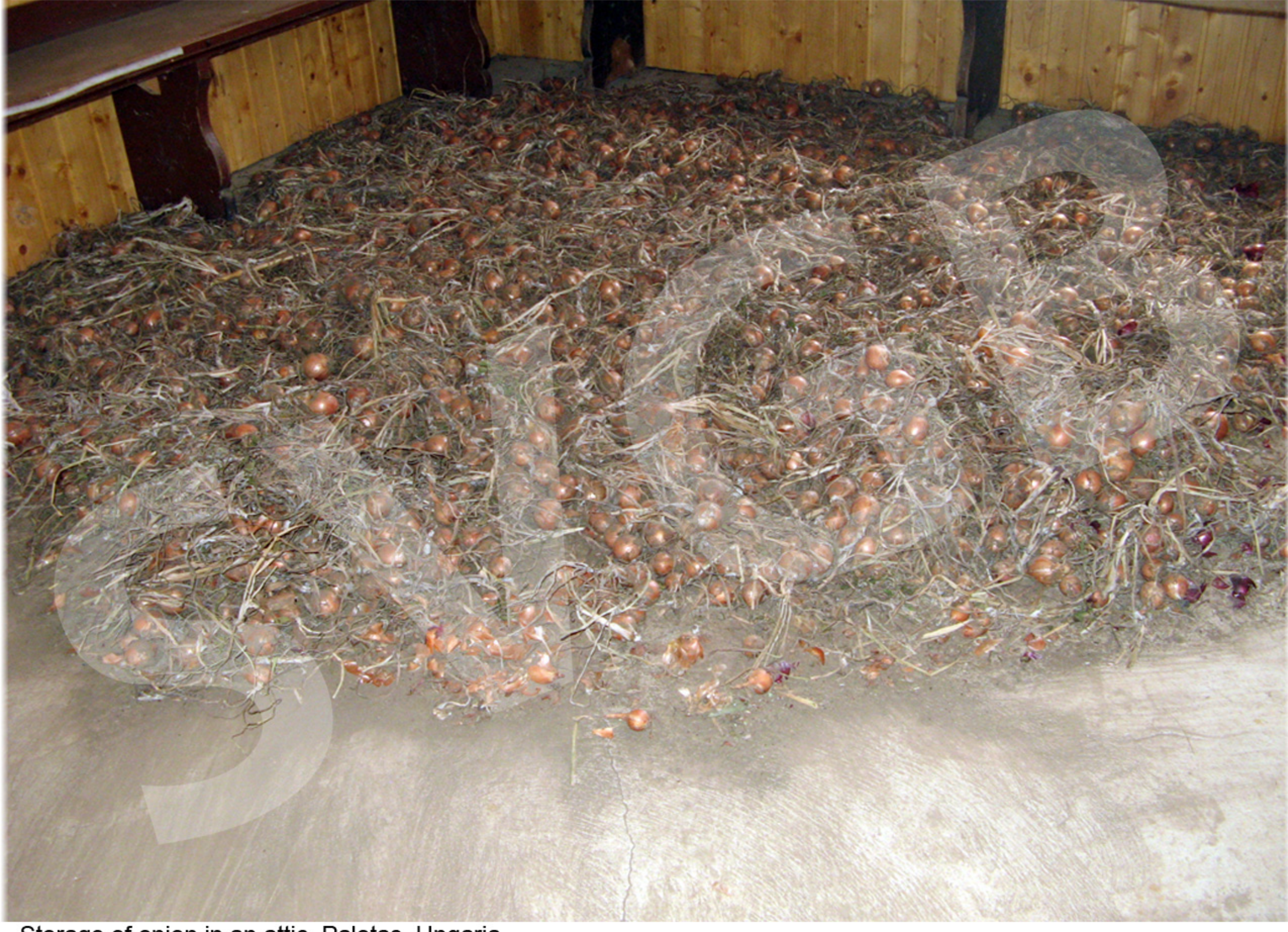
Storage of onion in an attic, Palotas, Ungaria