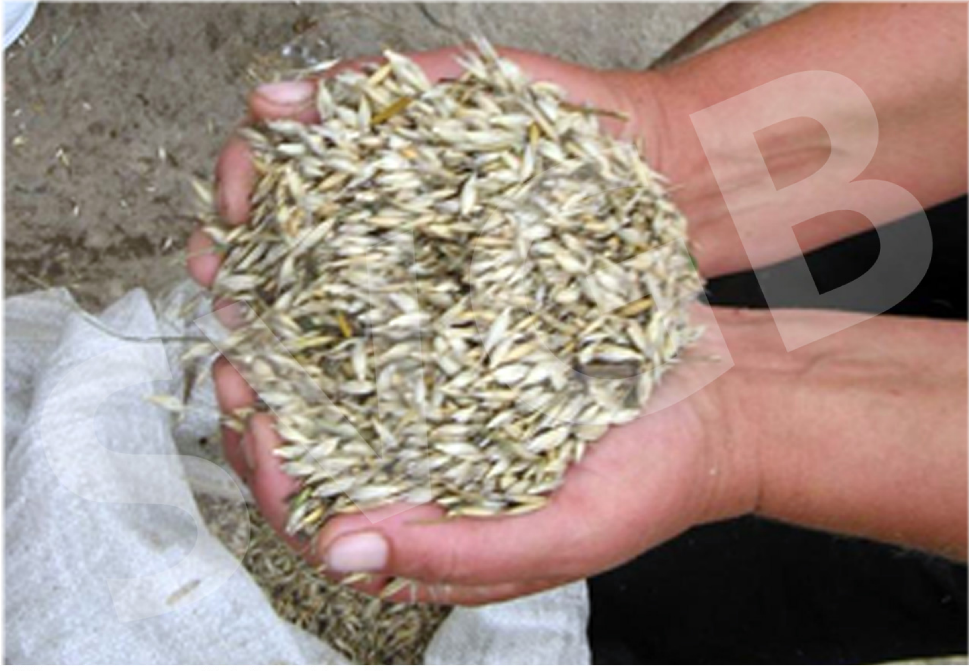
Triticum monococcum, Glod, Almaşu Mare, Alba