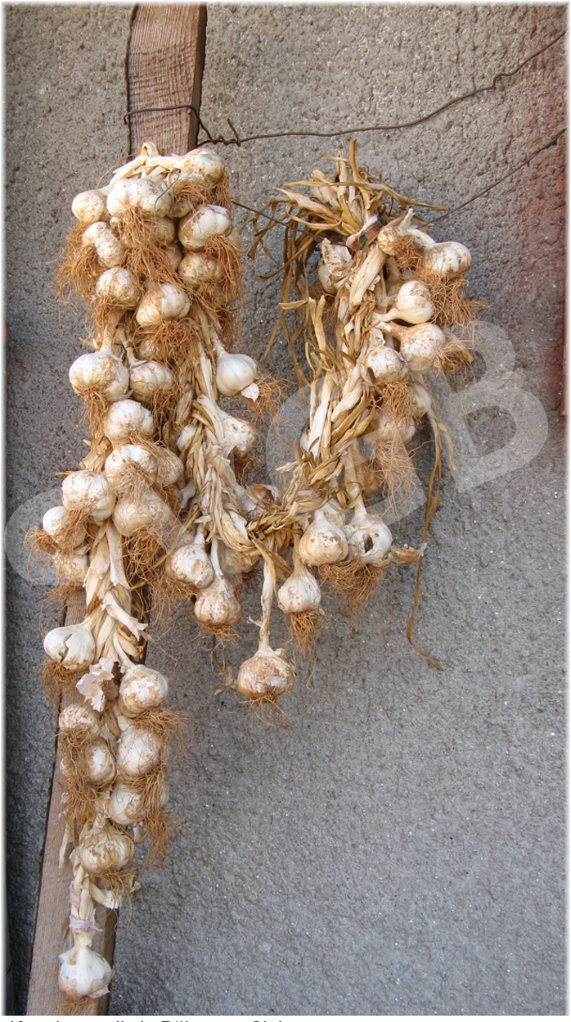
Keeping garlic in Băişoara, Cluj