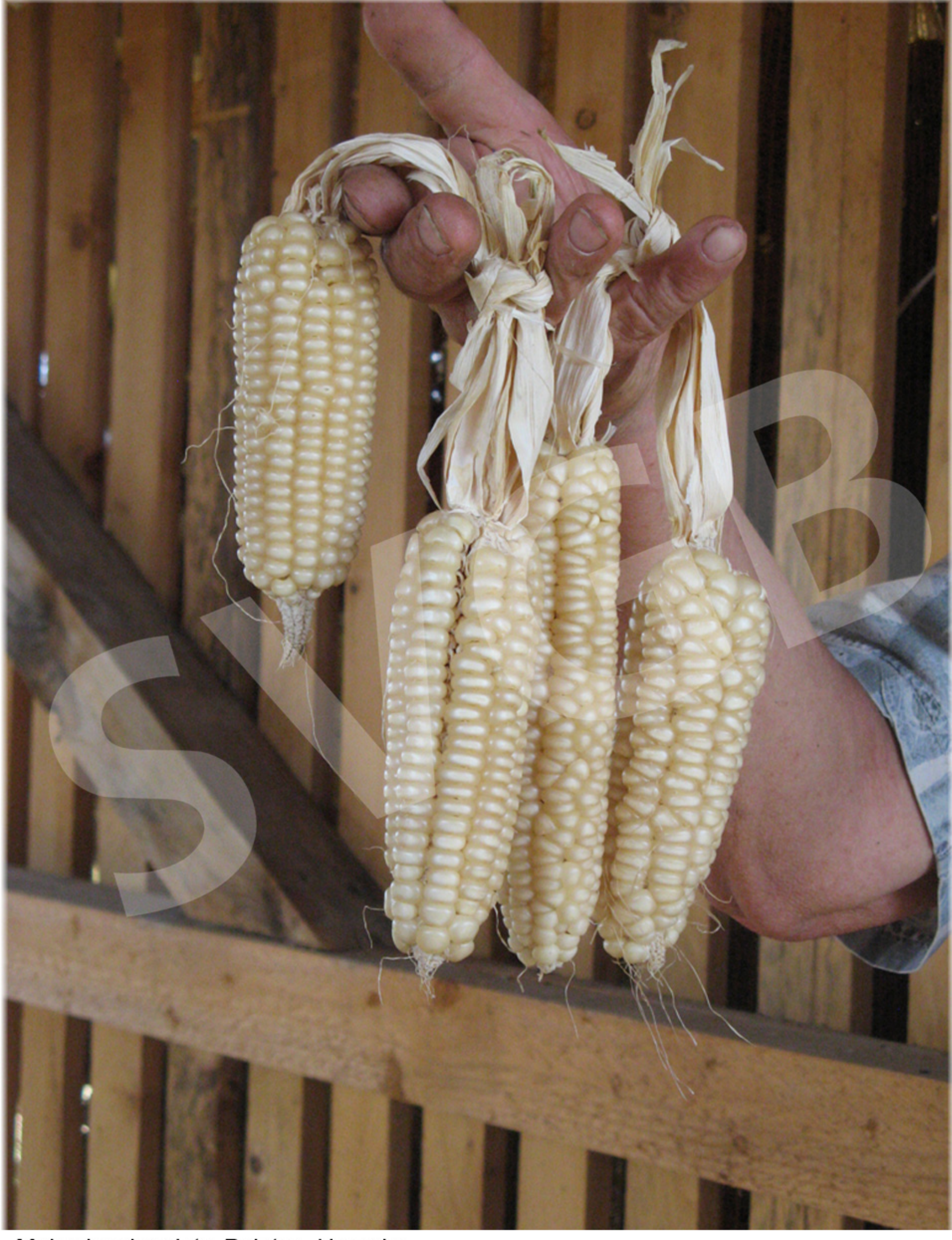
Maize local variety, Palotas, Ungaria