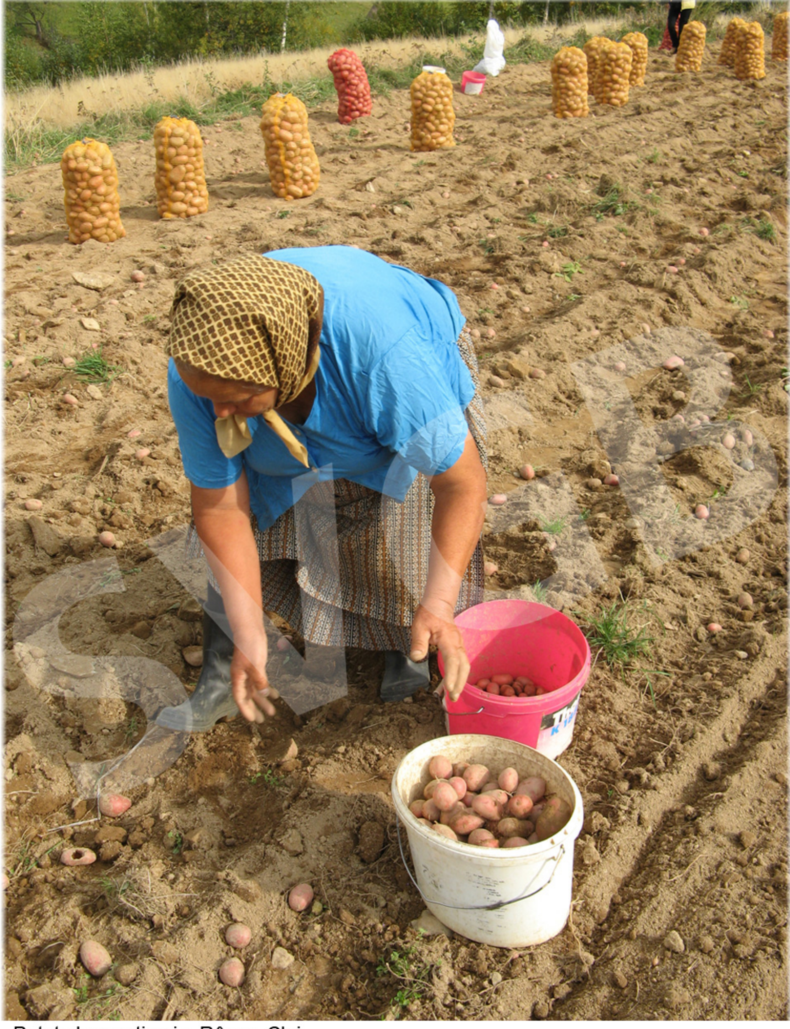
Potato harvesting in Râşca, Cluj