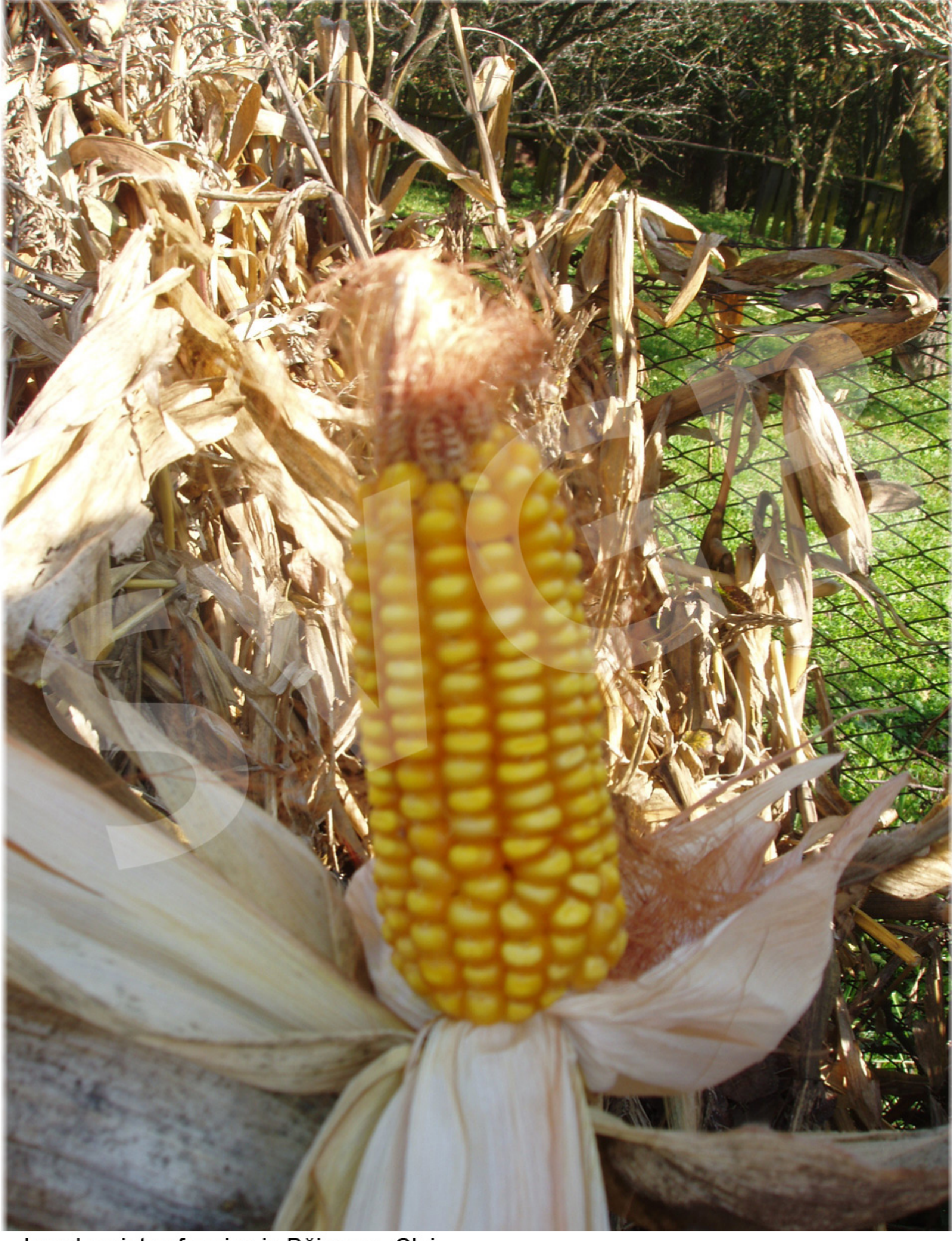
Local variety of maize in Băişoara, Cluj