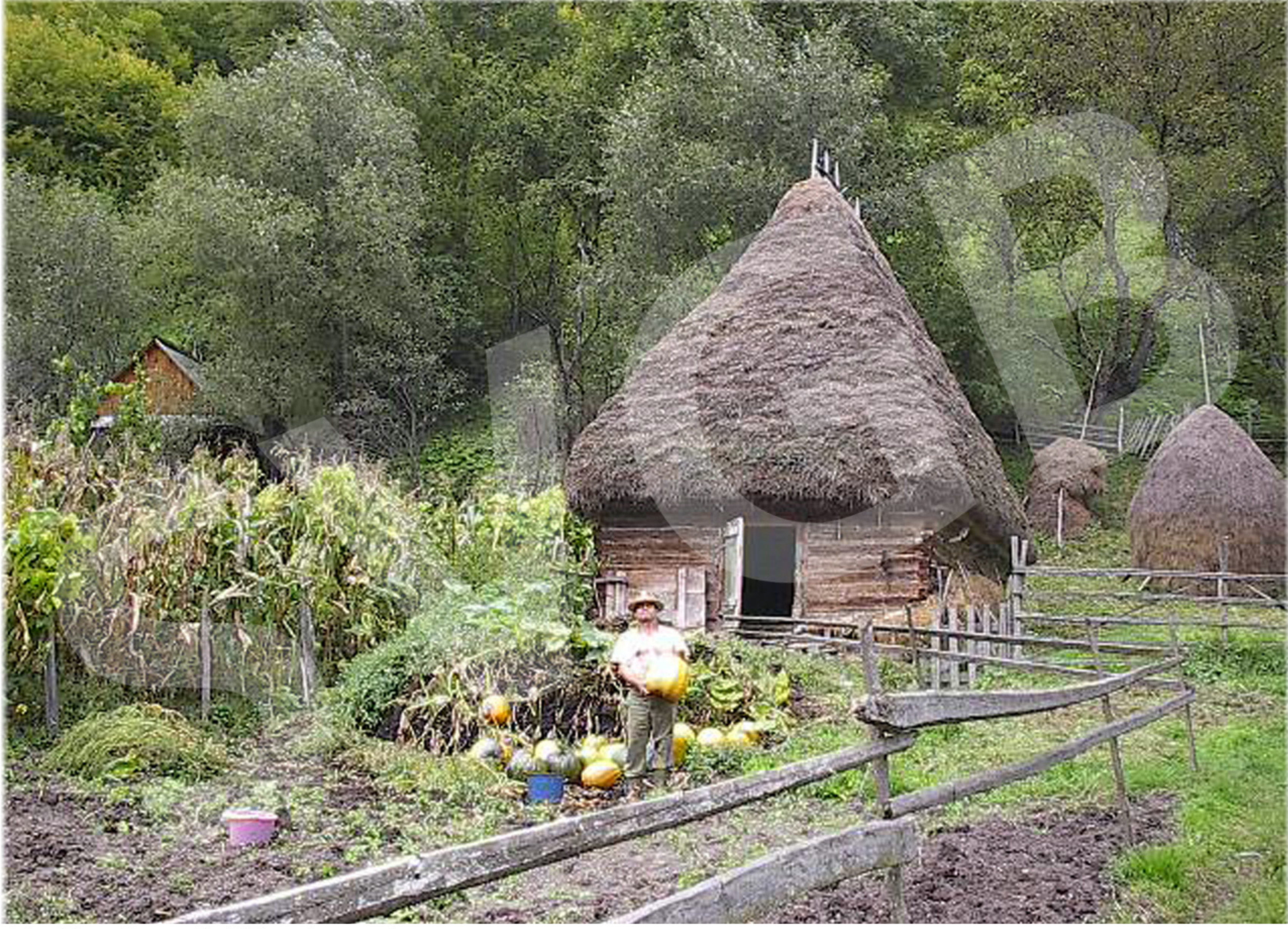
Traditional household from Apuseni