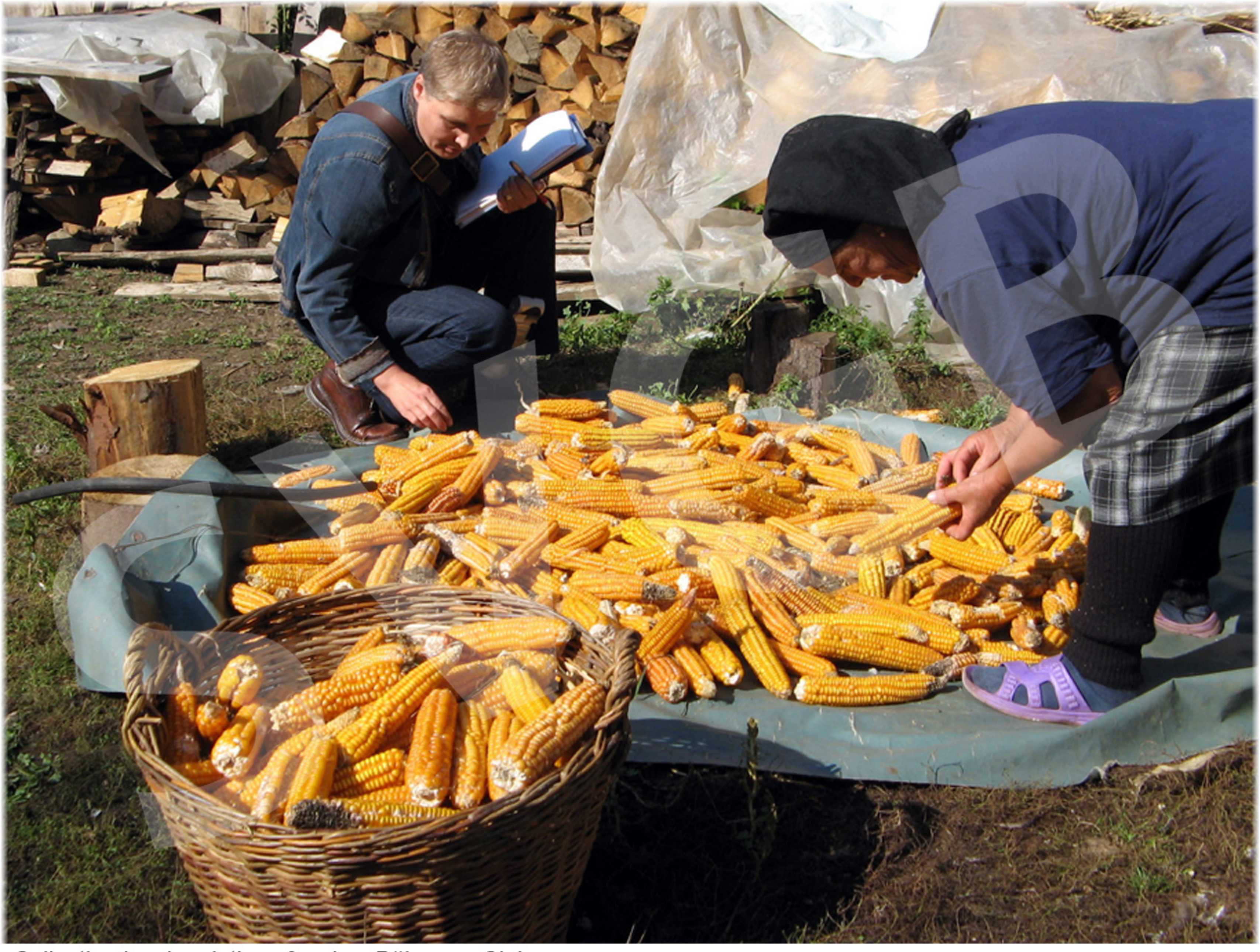
Collecting local varieties of maize, Băişoara, Cluj