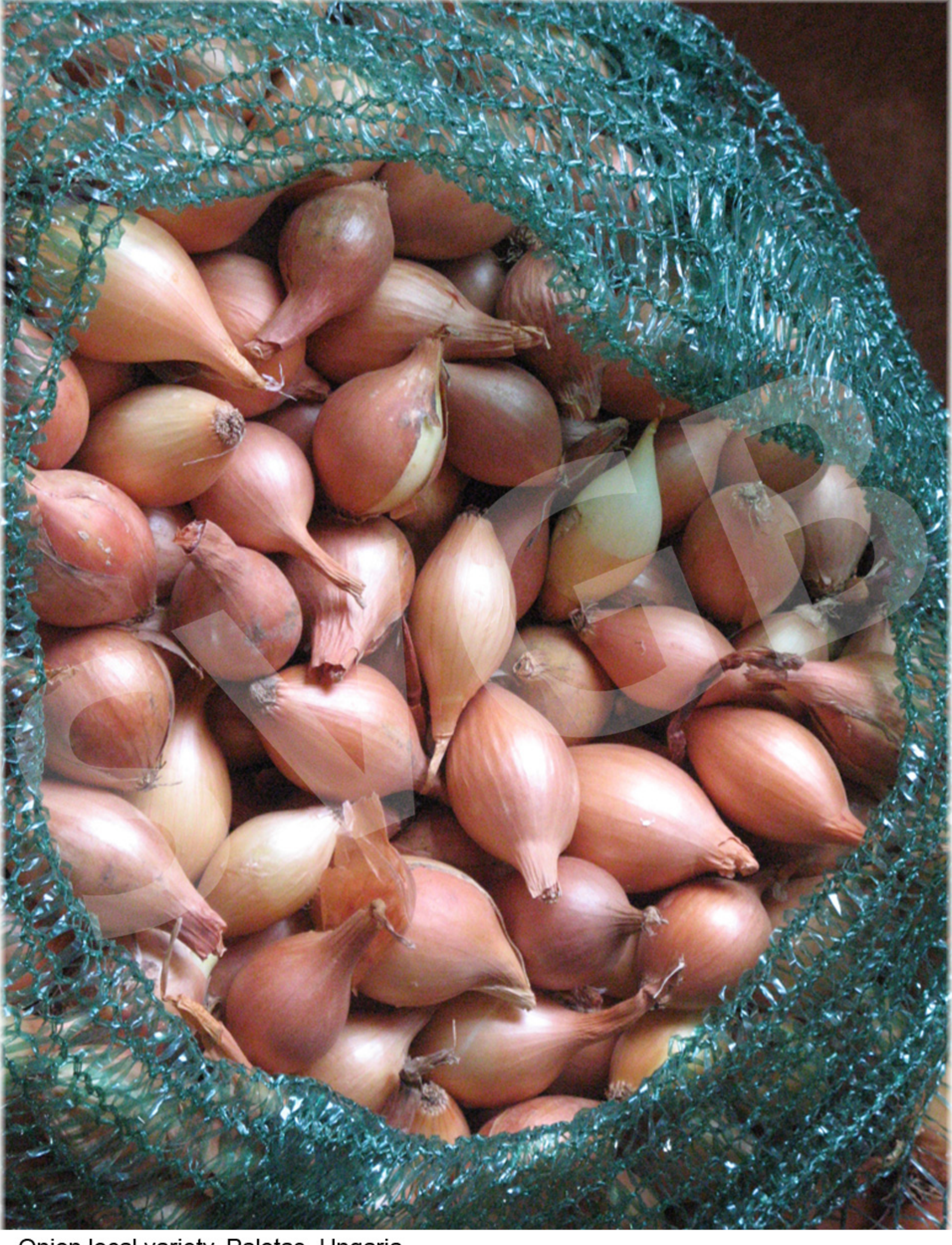
Onion local variety, Palotas, Ungaria