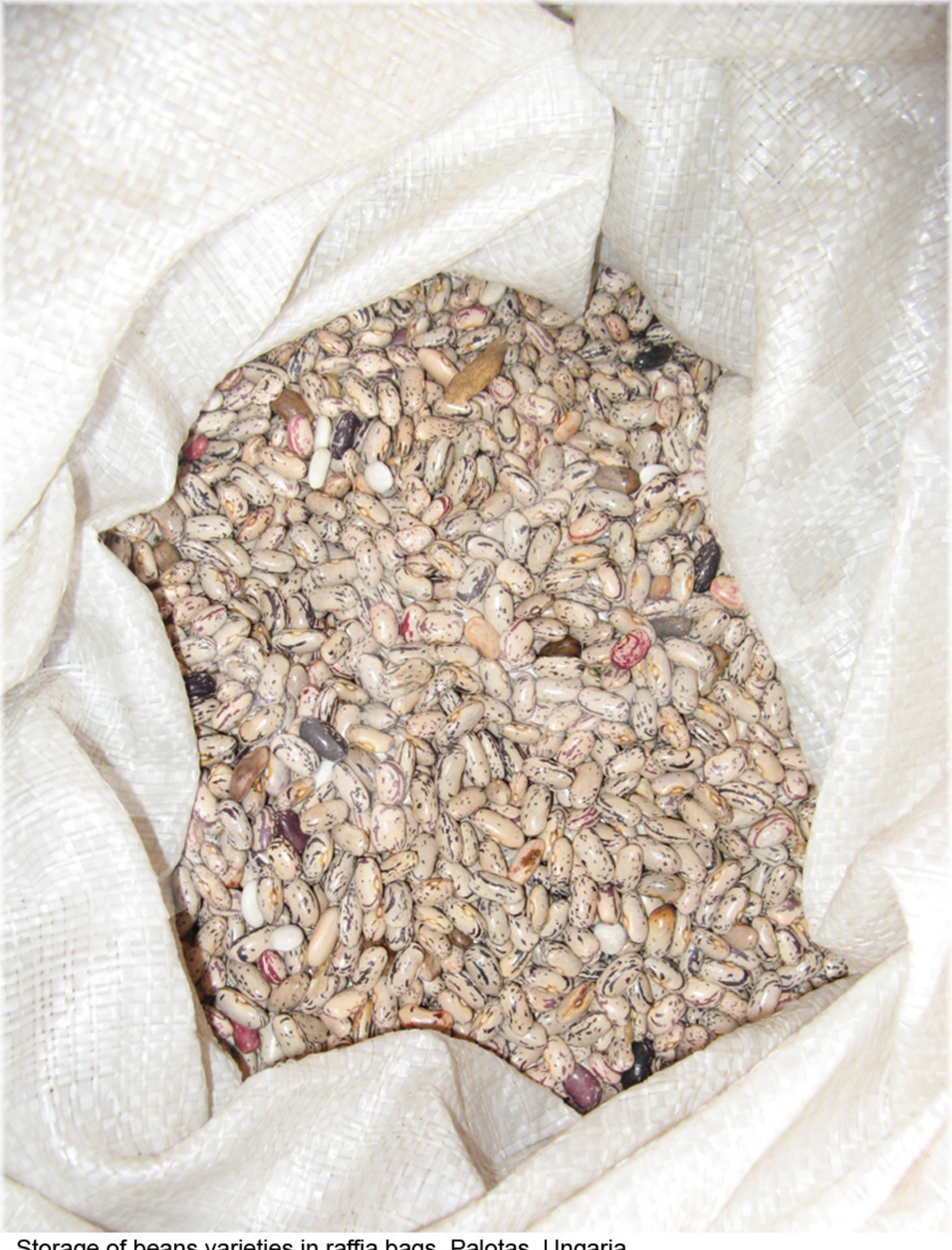
Storage of beans varieties in raffia bags, Palotas, Ungaria