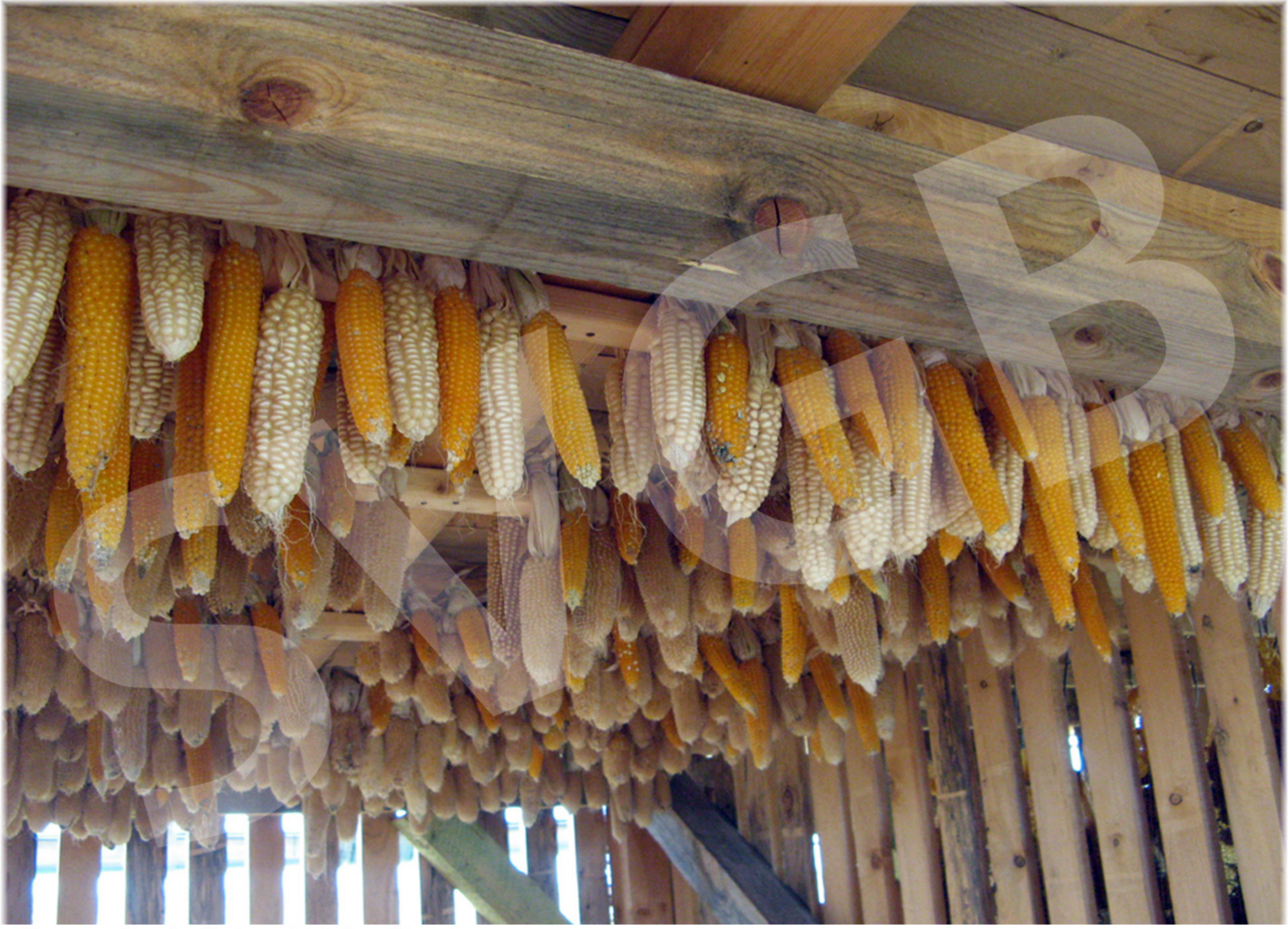
Storage of maize in barn, Palotas, Ungaria