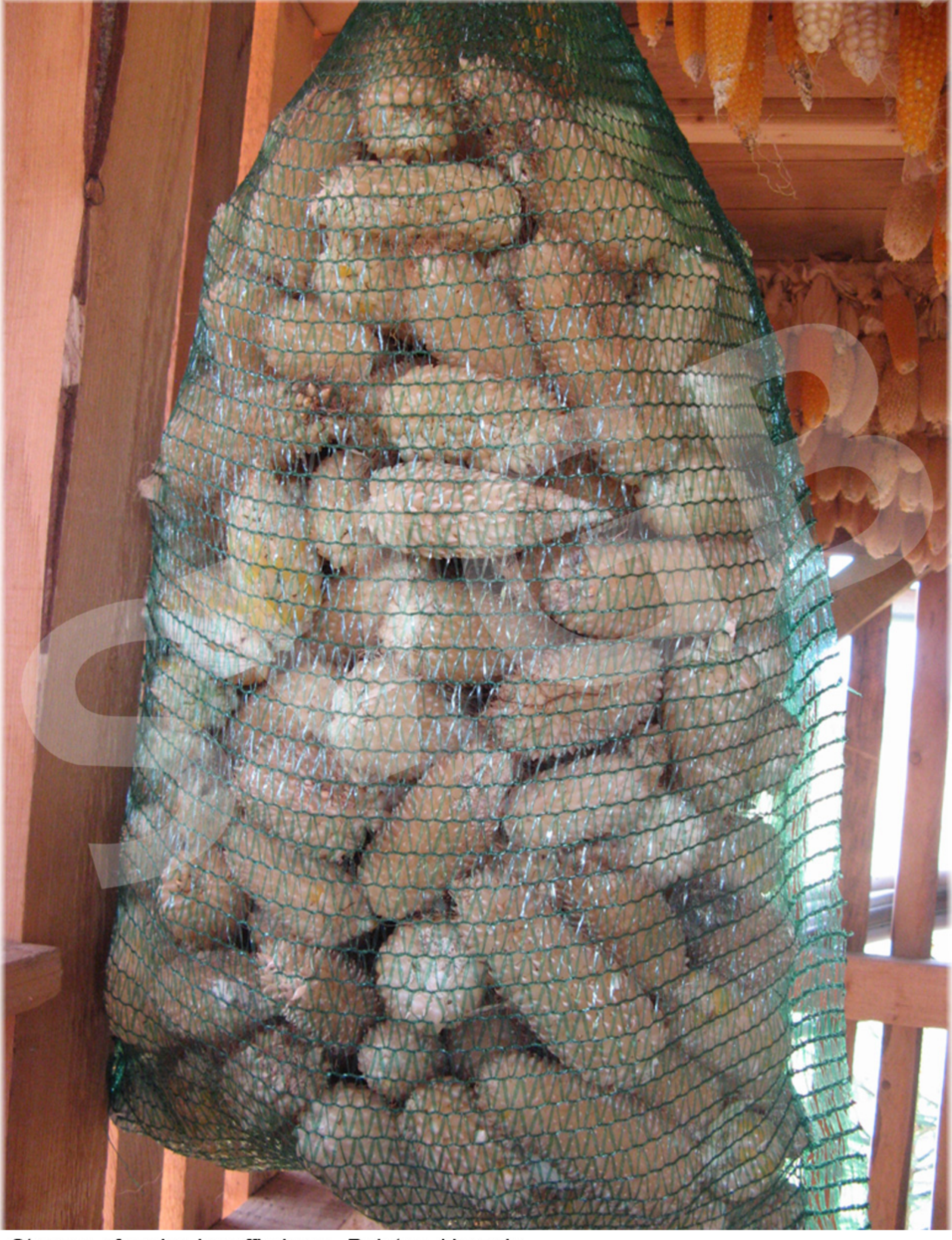
Storage of maize in raffia bags, Palotas, Ungaria