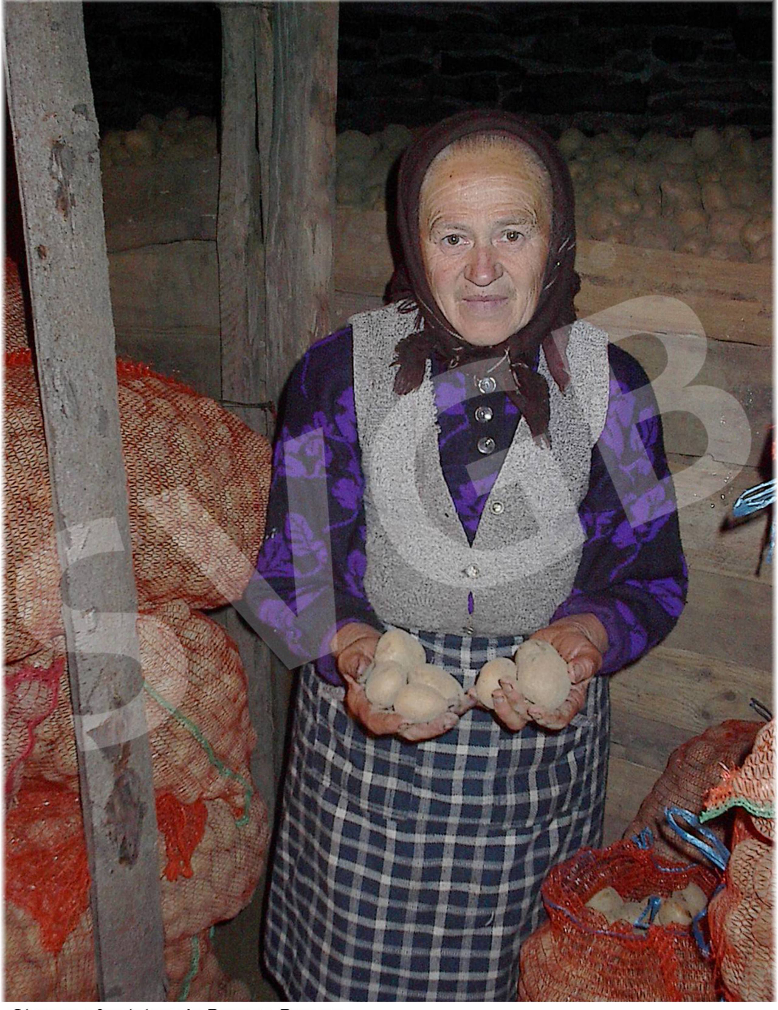
Storage of potatoes in Breaza, Braşov