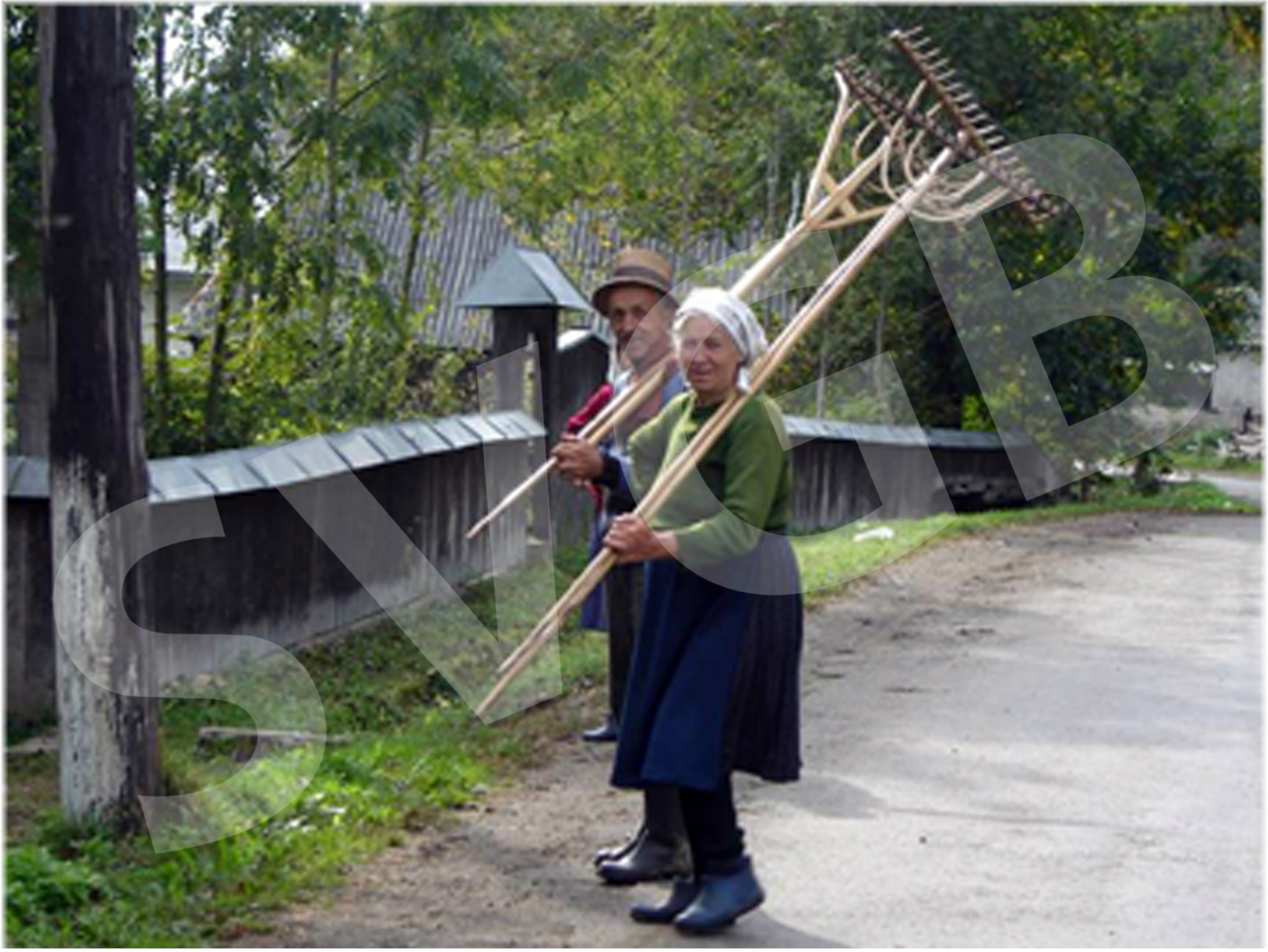
Keepers of traditional agriculture, Maramureş (1)