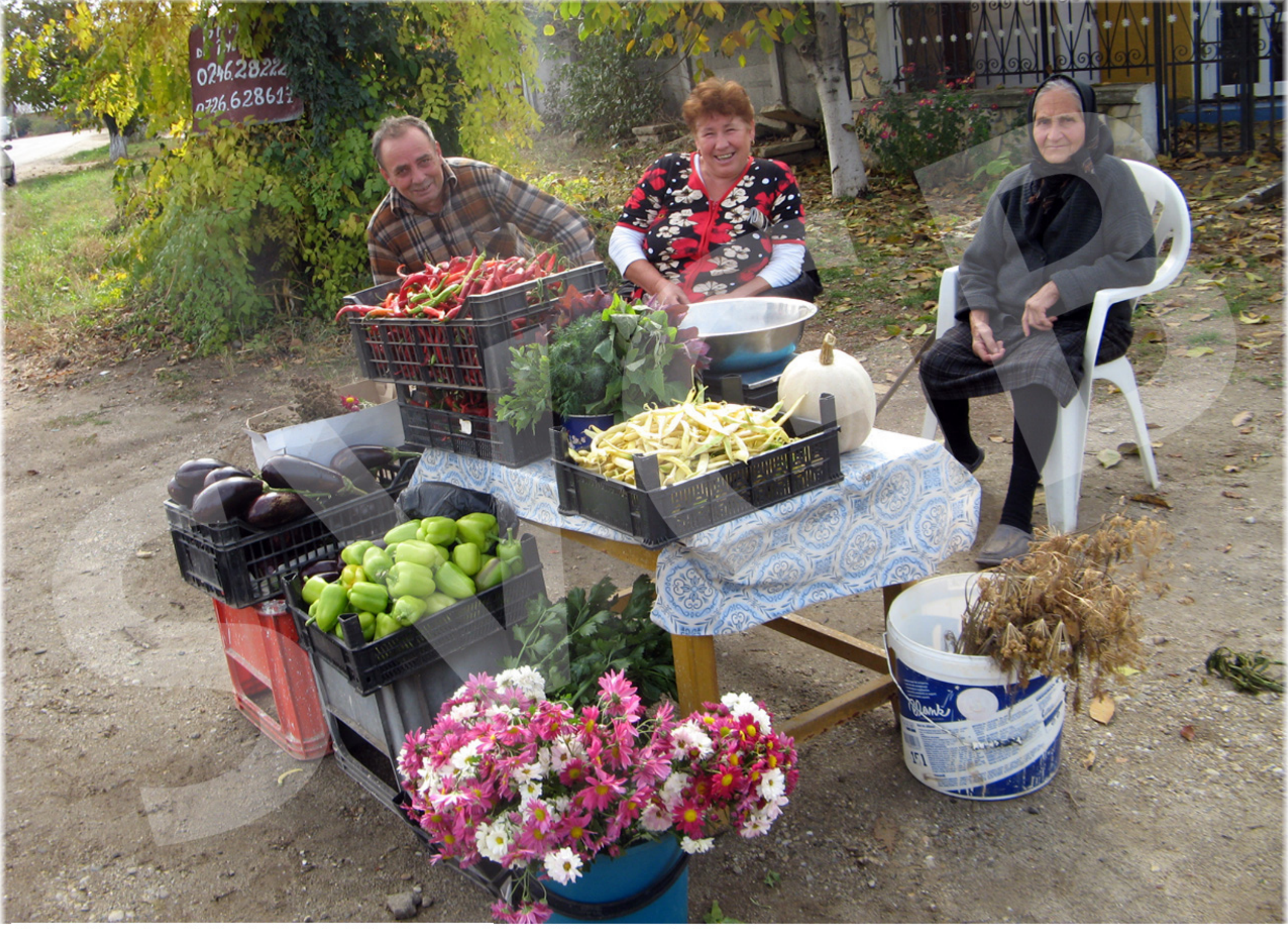
Sale of local varieties in front of the house, Adunații Copăceni, Giurgiu