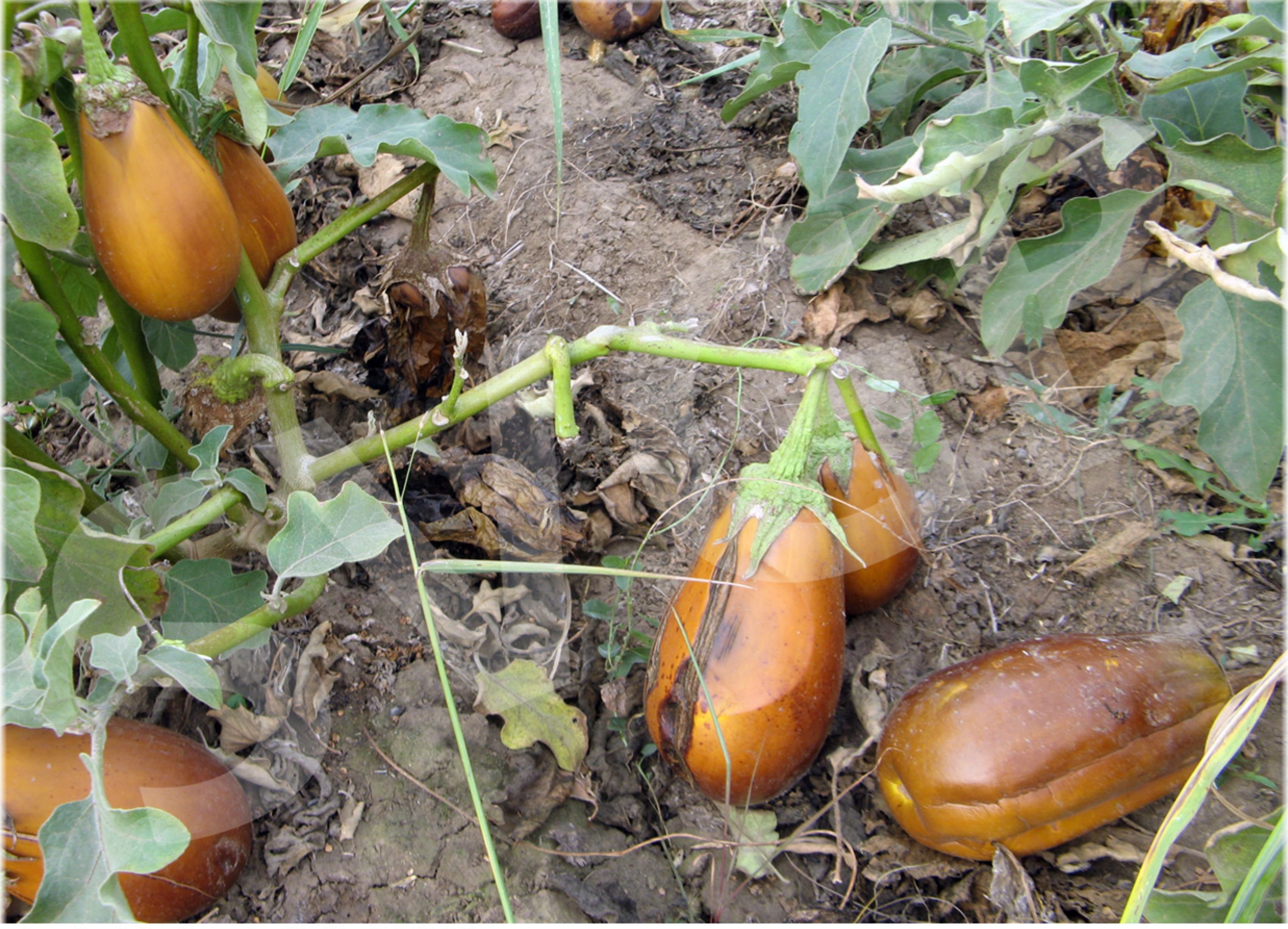
Local variety of eggplant in Giuvărăşti, Olt