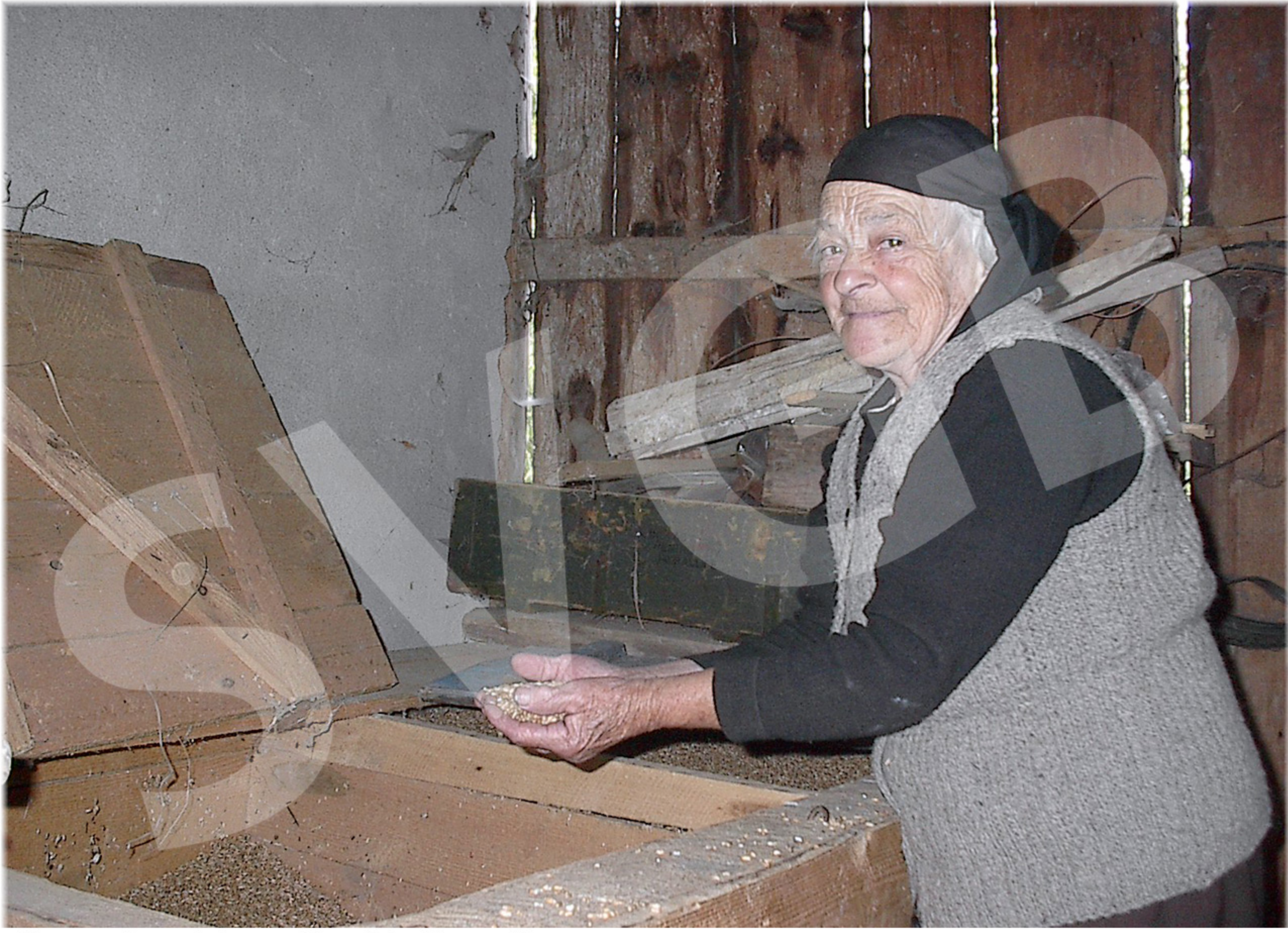
Storage of cereals in wood box, Telechirecea, Braşov