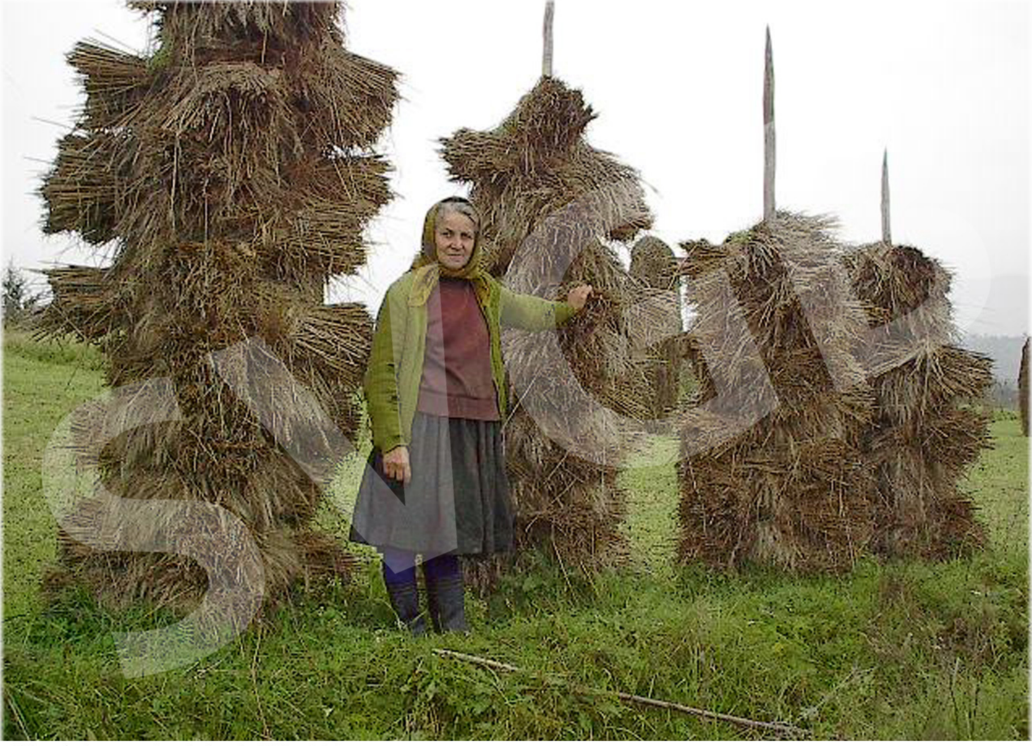
Wheat sheaves for drying in Văleni, Maramureş