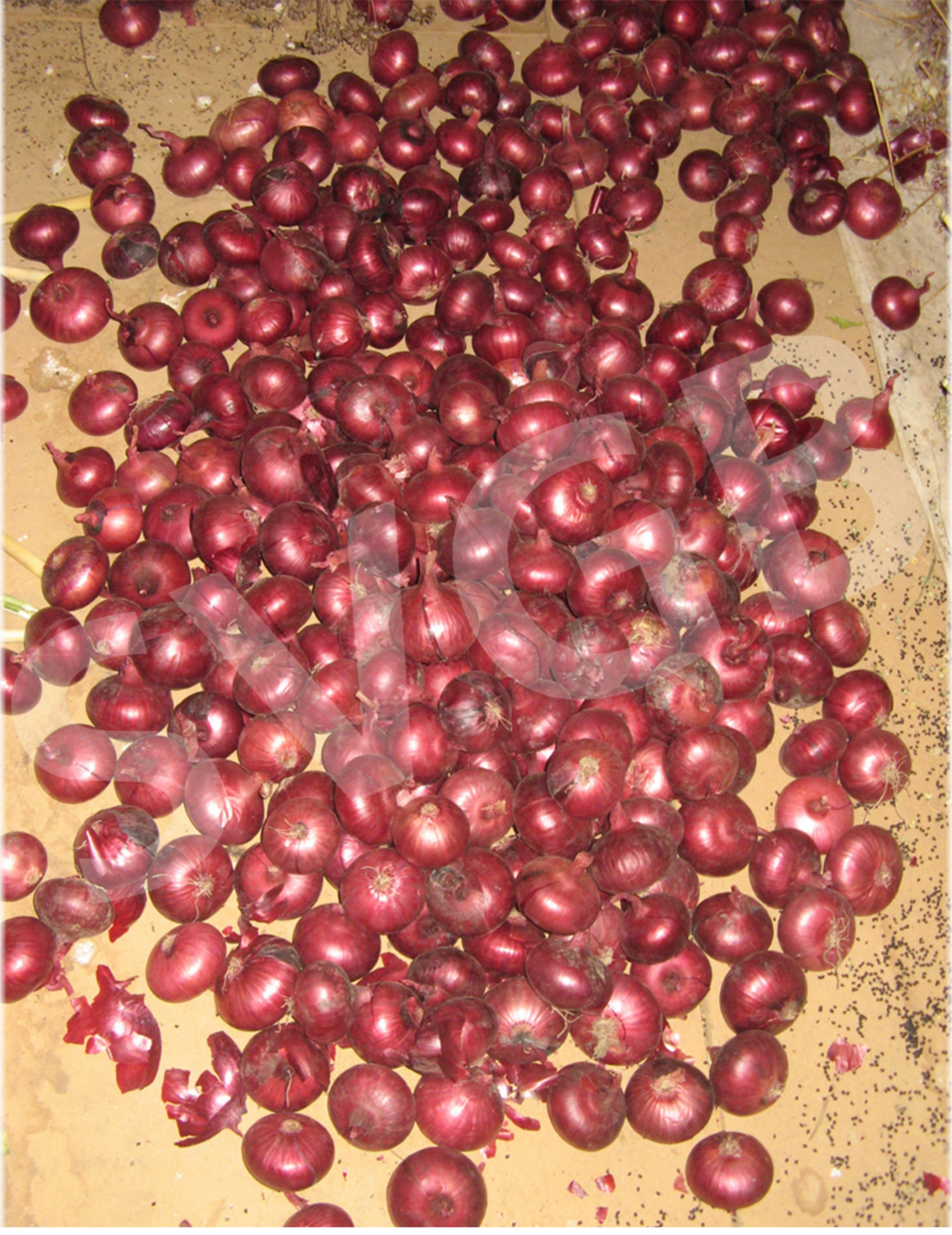
Local variety of red onion, Palotas, Ungaria