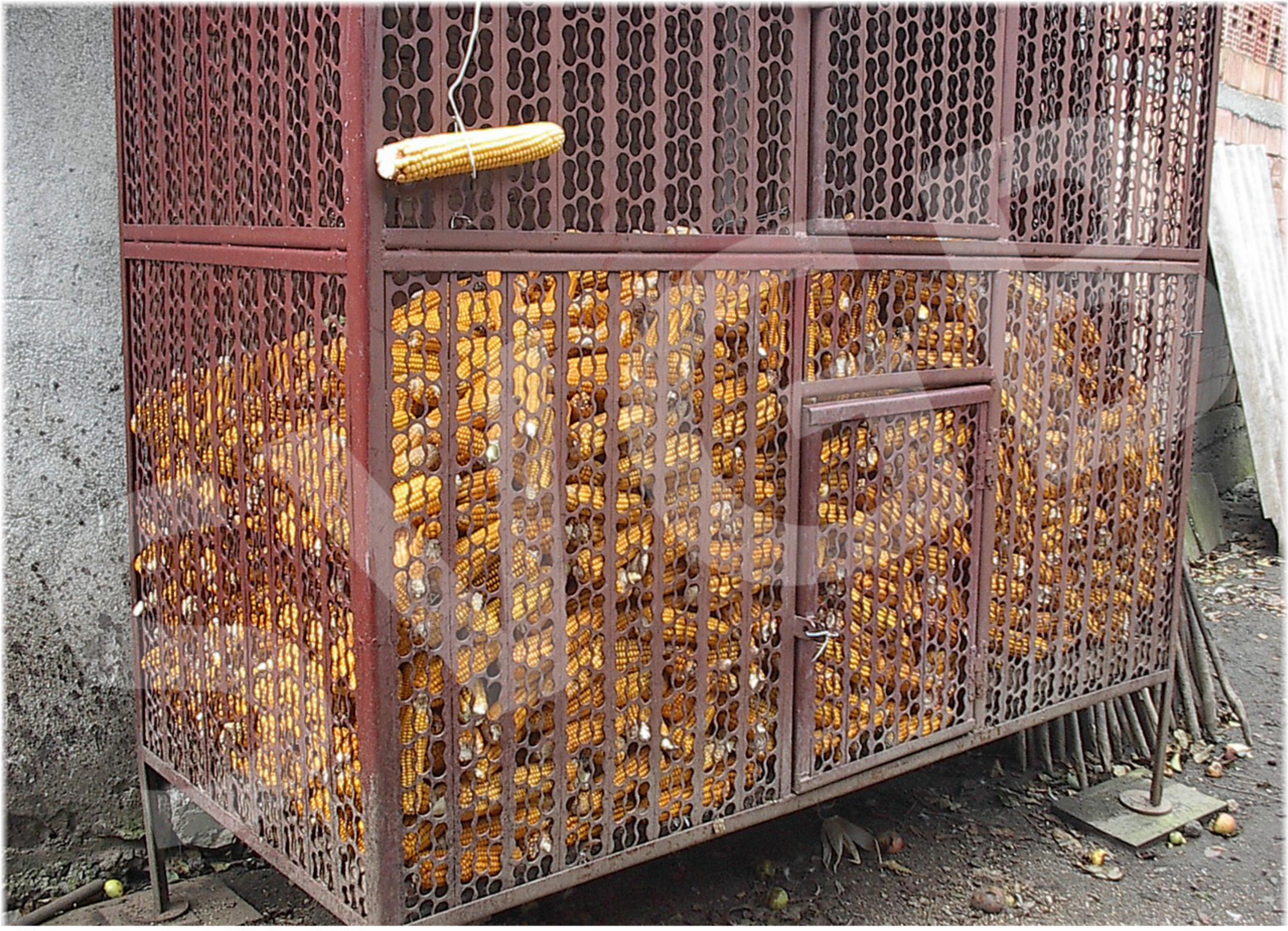
Storage of maize in Răşinari, Sibiu