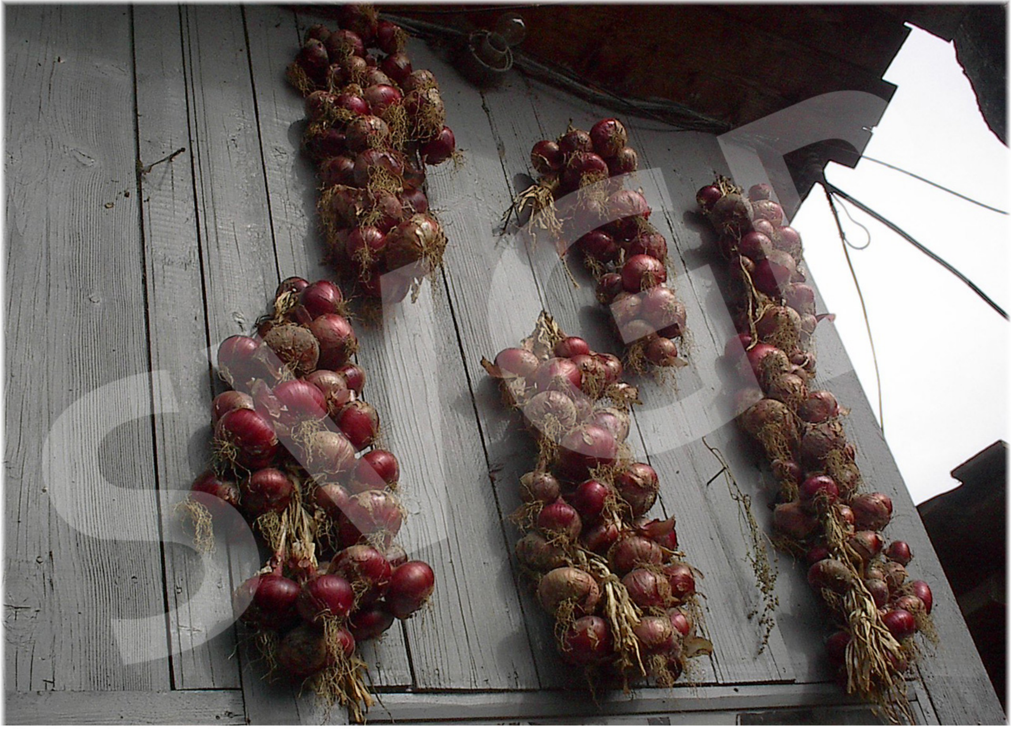
Braided red onion for drying, Dejani, Sibiu