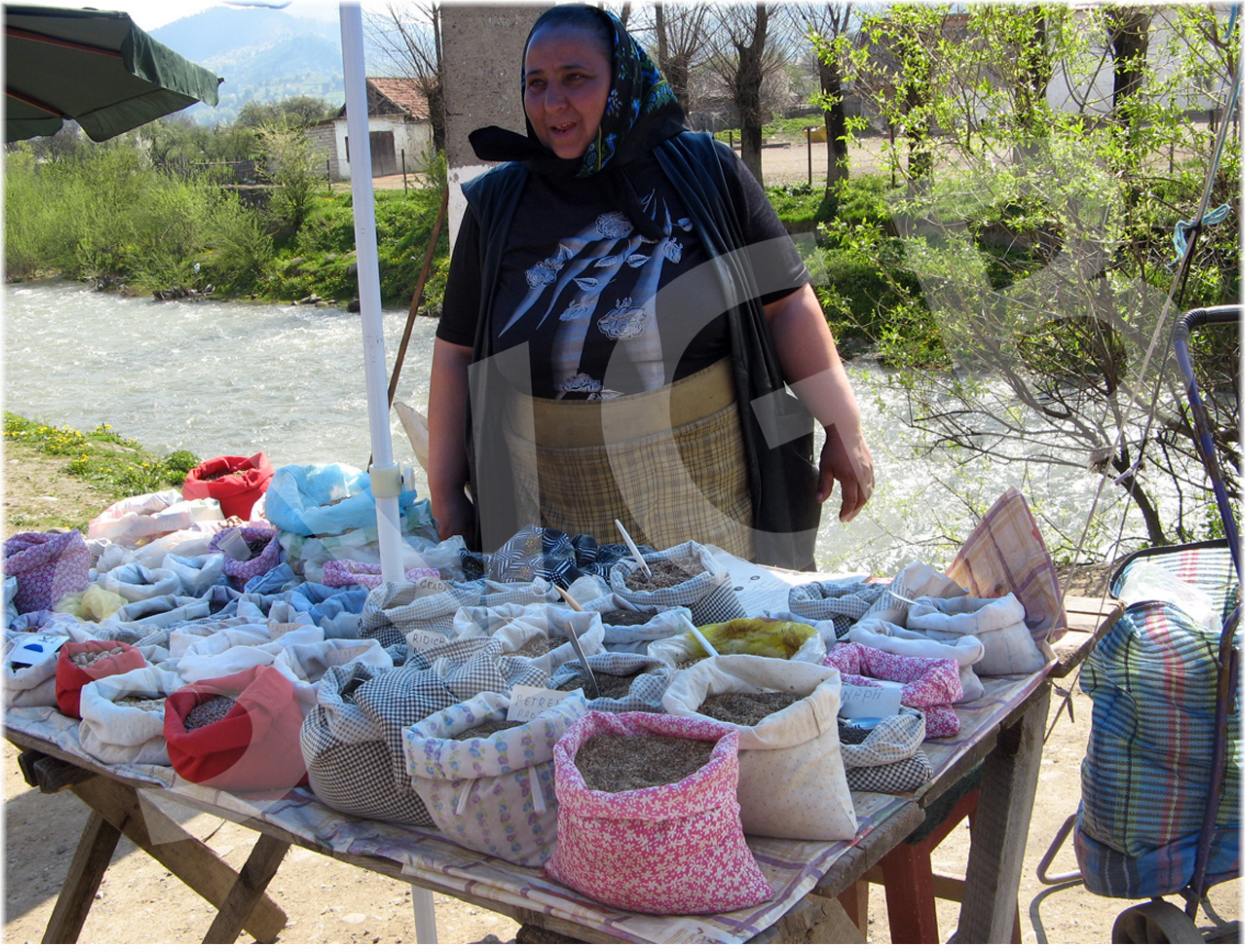
Sale of seeds in local market, Săcel, Maramureş