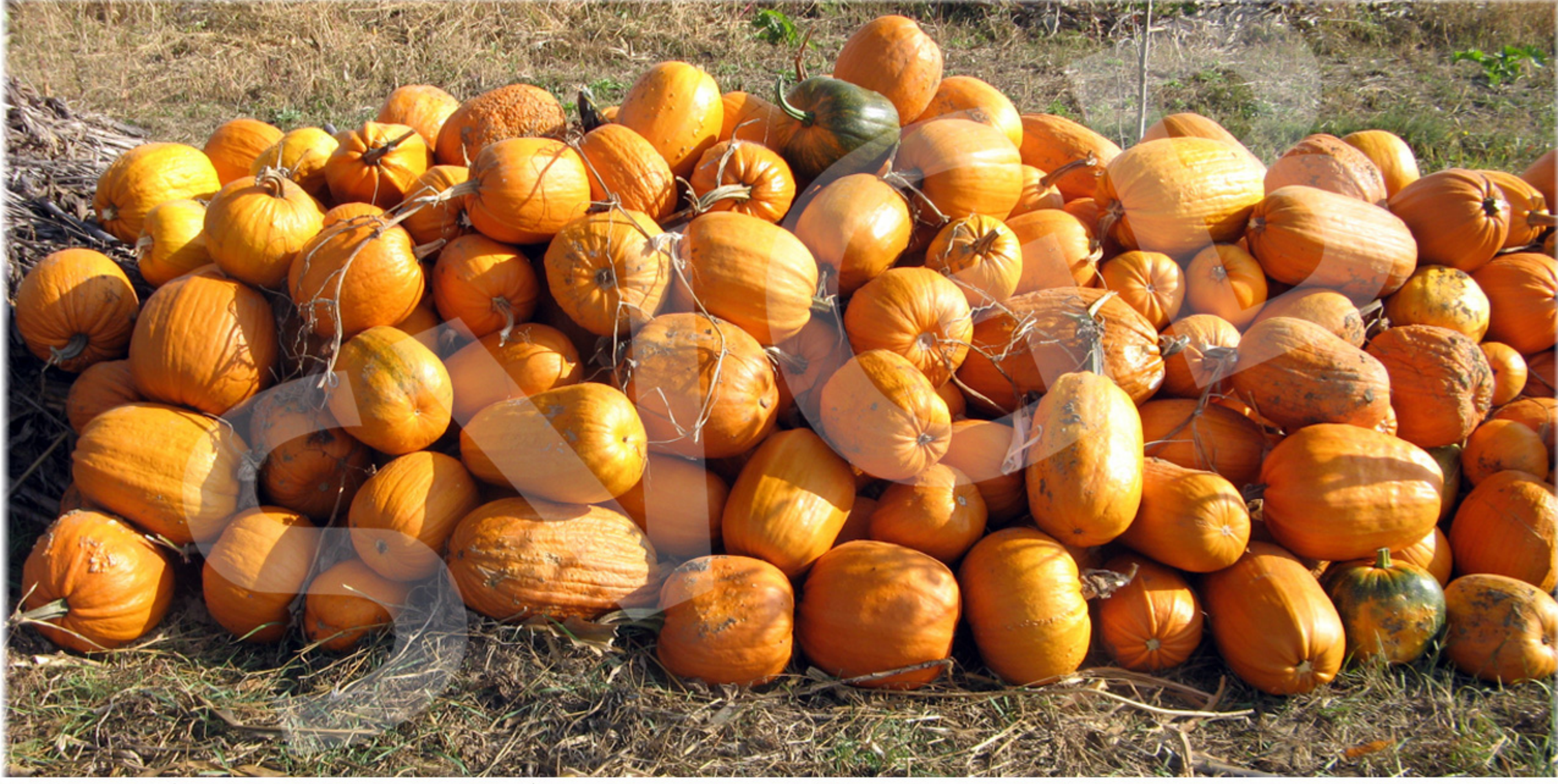
Local variety of pumpkin in Vorona, Botoşani