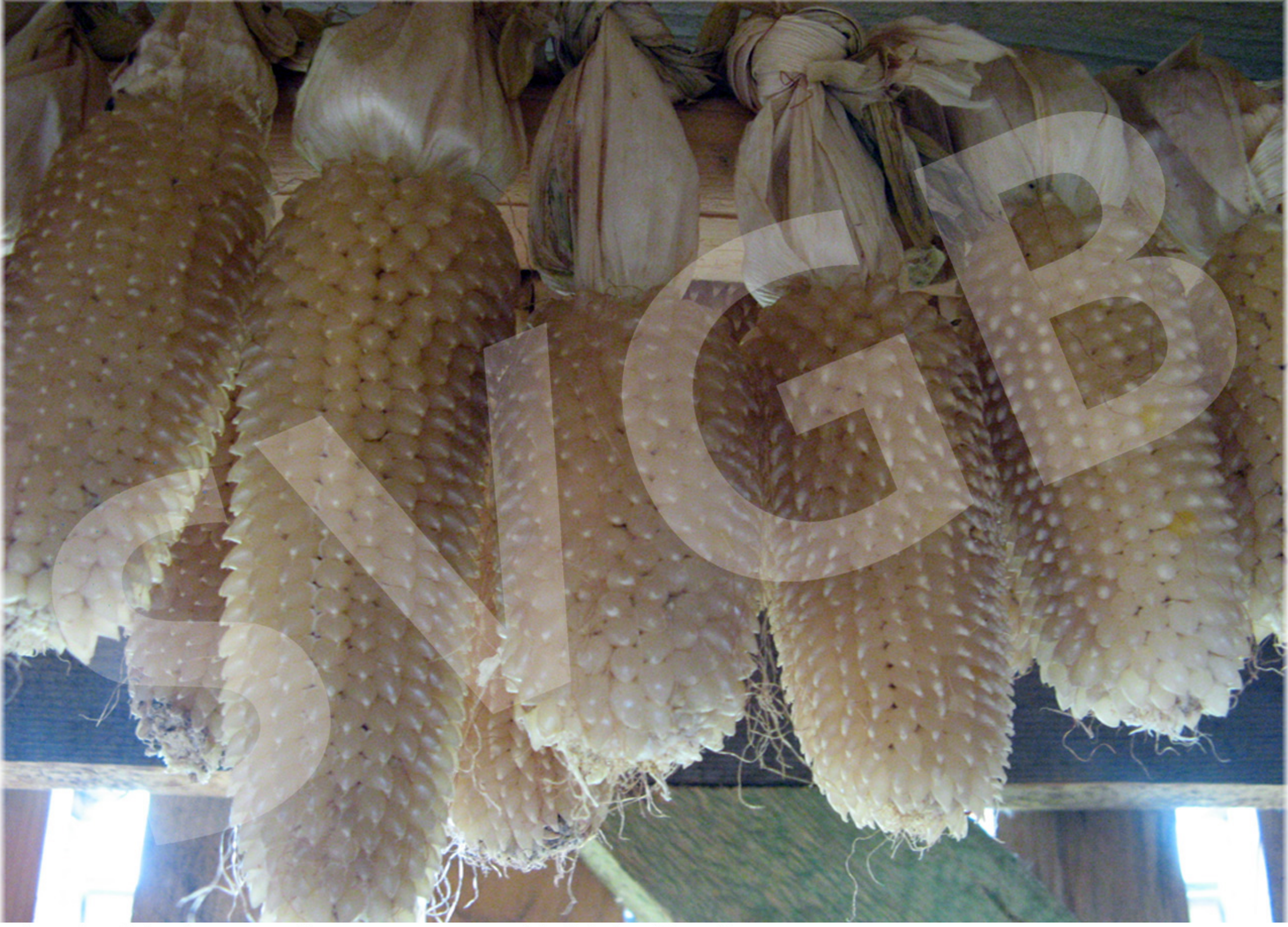
Local variety of popcorn (Zea mays conv. everta), Palotas, Ungaria