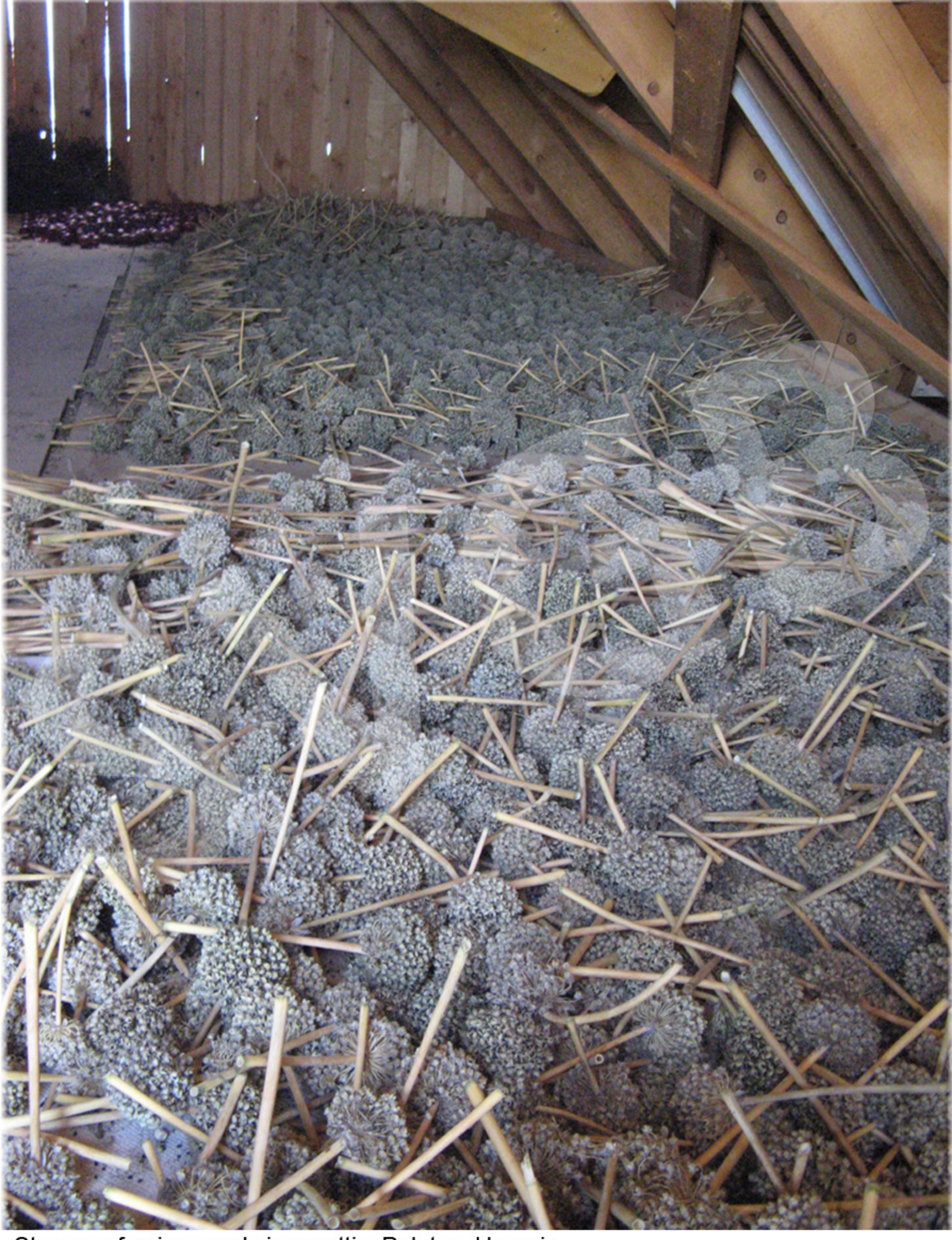
Storage of onion seeds in an attic, Palotas, Ungaria