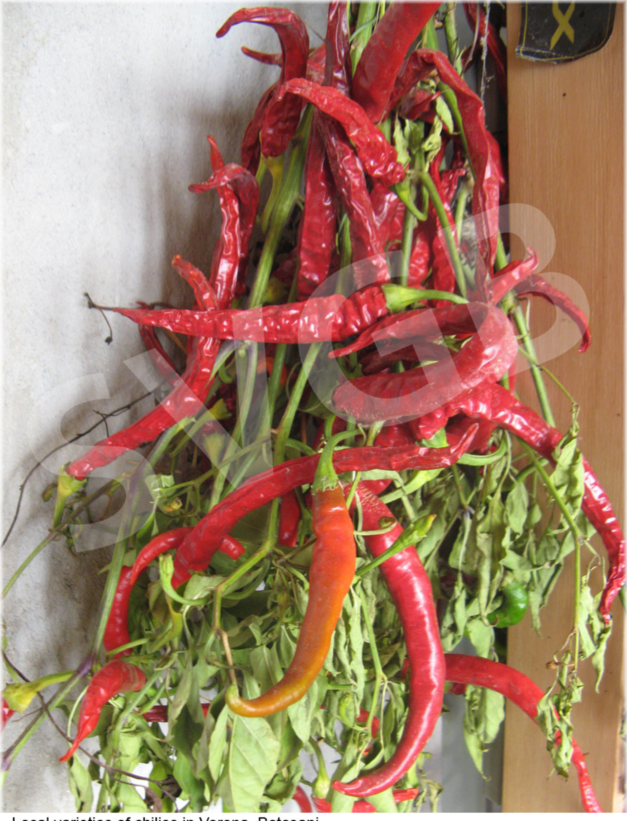
Local varieties of chilies in Vorona, Botoşani