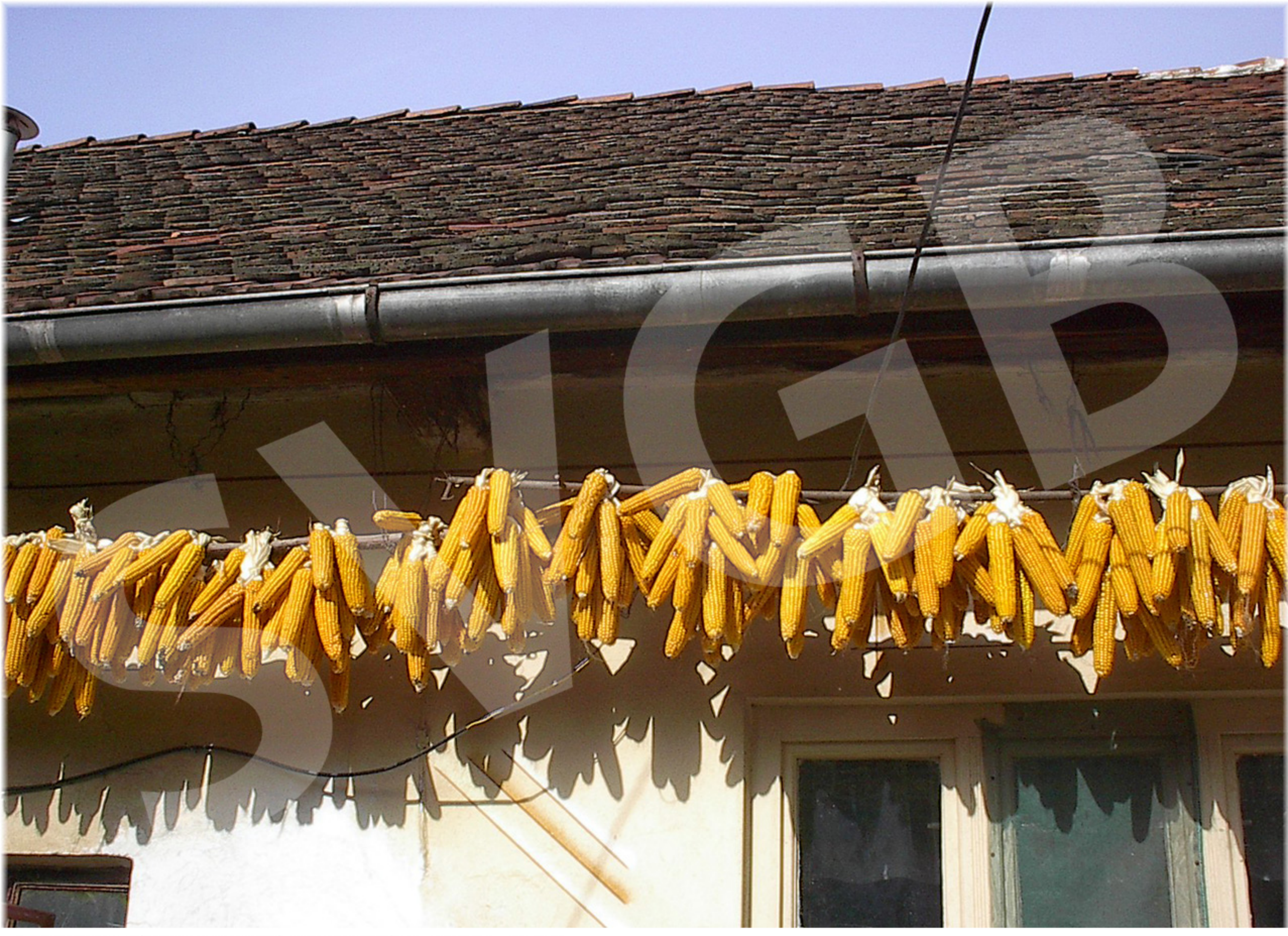
Local variety of maize at eaves of the house, Sibiu