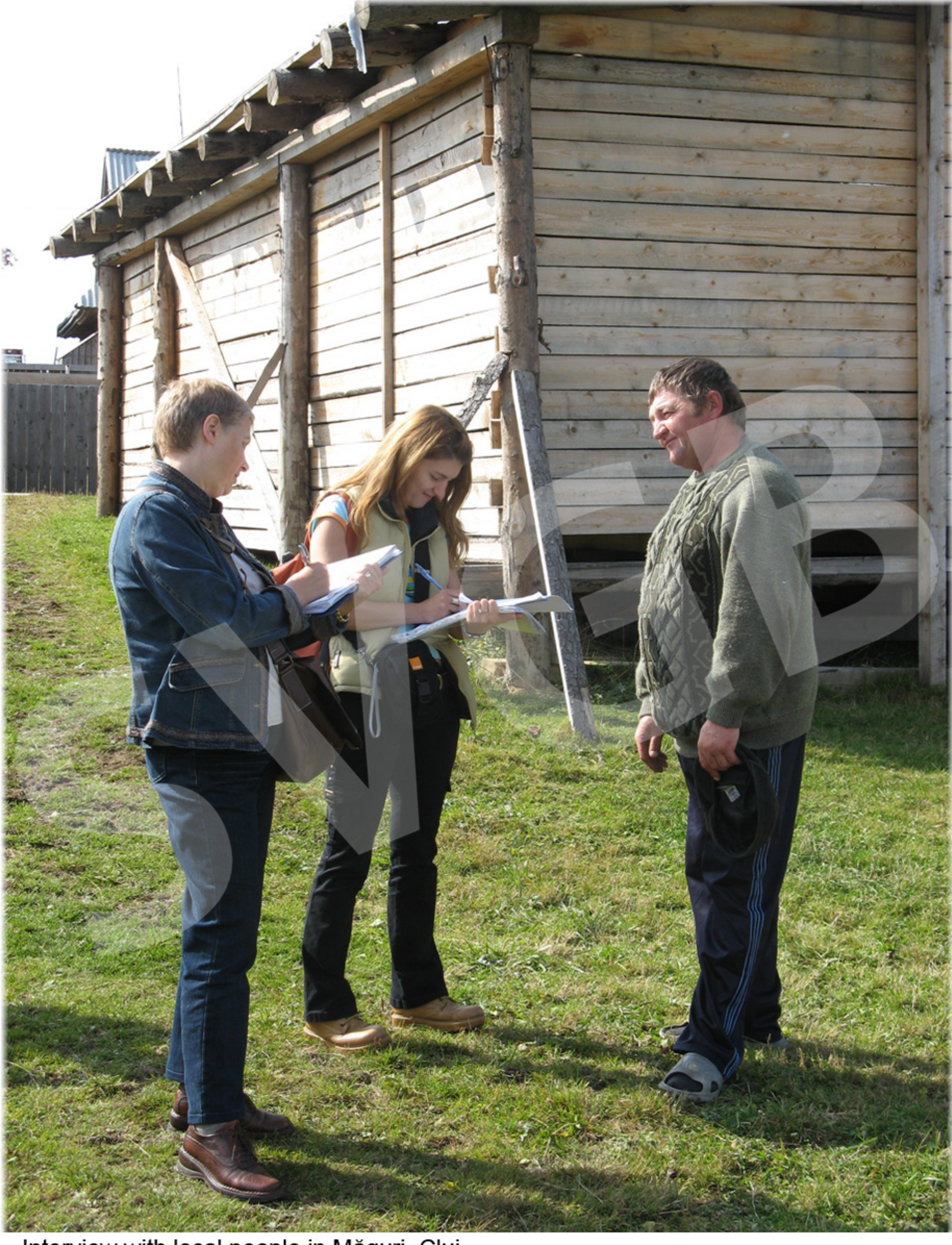
Interview with local people in Măguri, Cluj