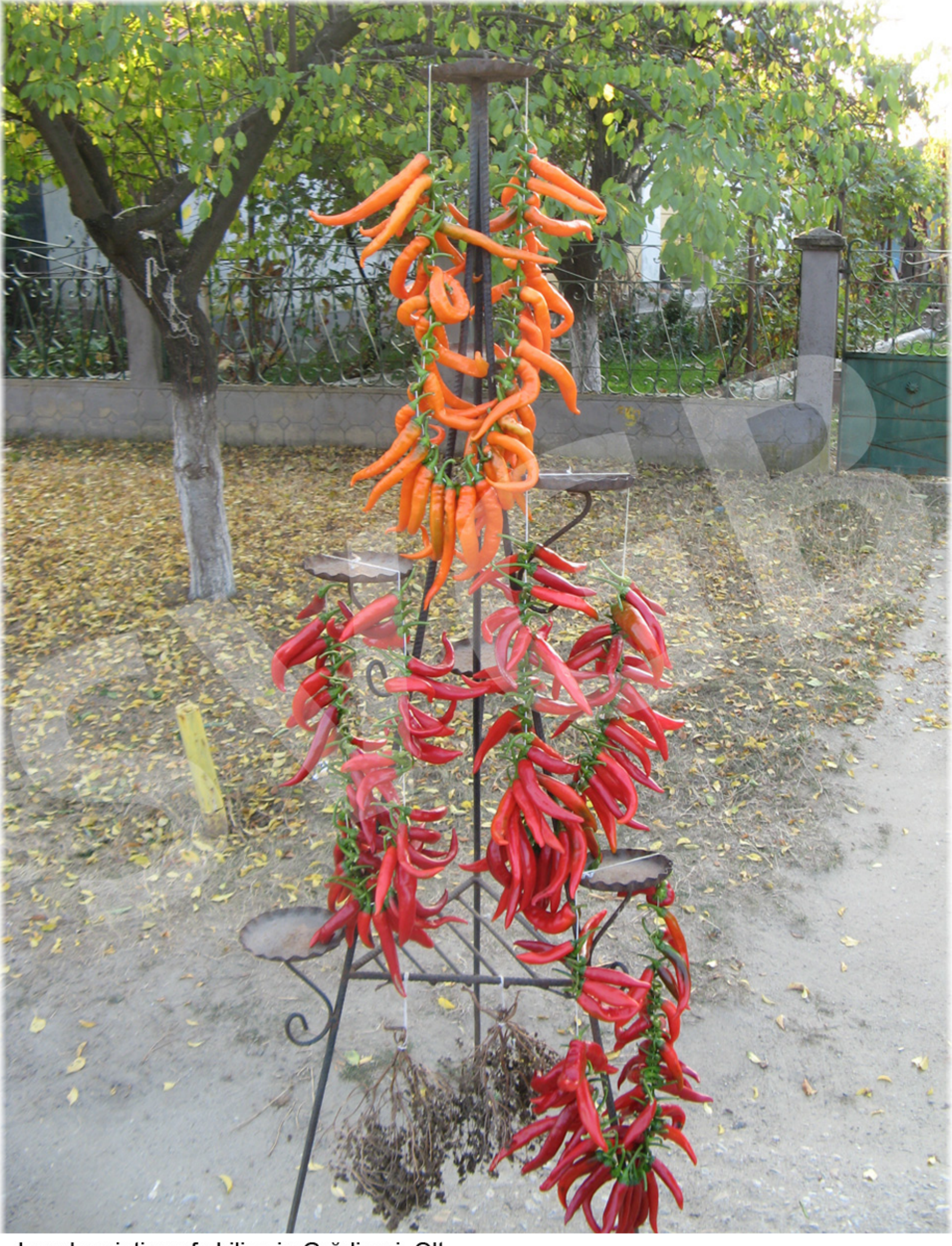
Local varieties of chilies in Grădinari, Olt