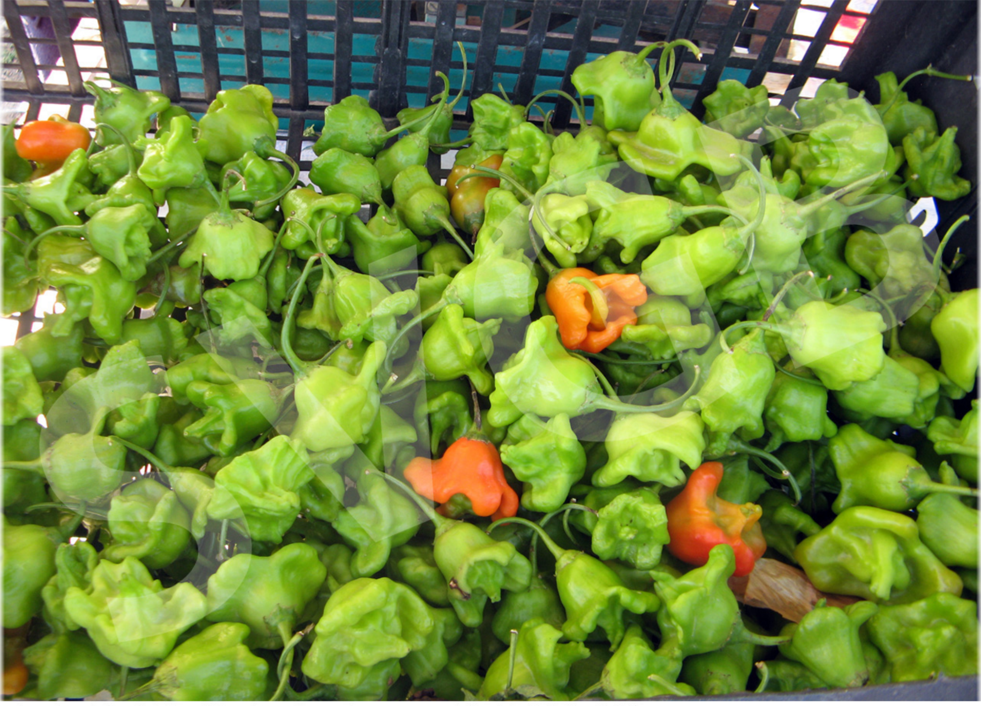
Local variety of chilies (Capsicum baccatum var. pendulum) in Grădinari, Olt