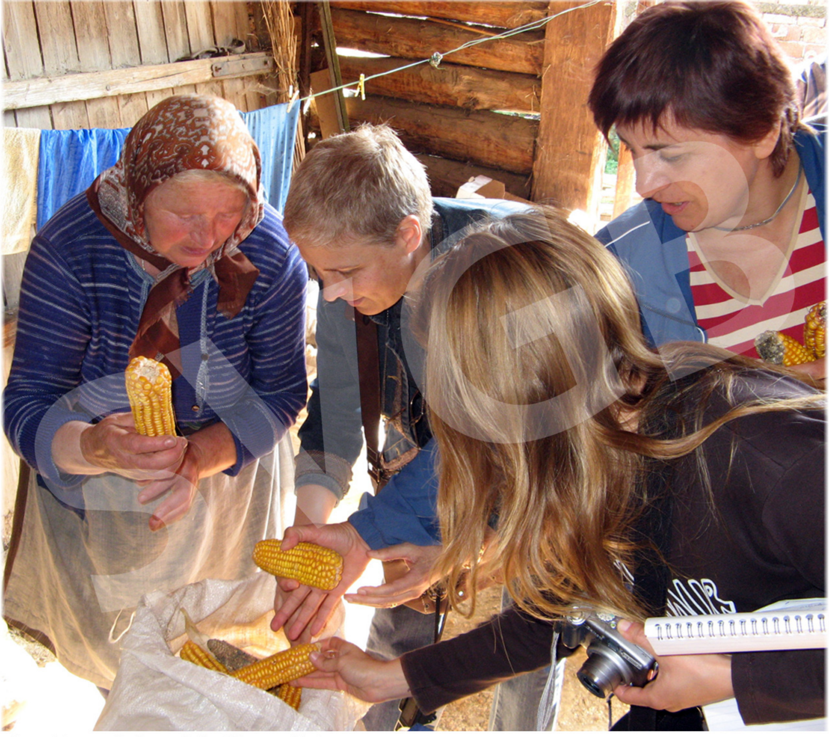
Aspect from collecting activity, Băişoara, Cluj