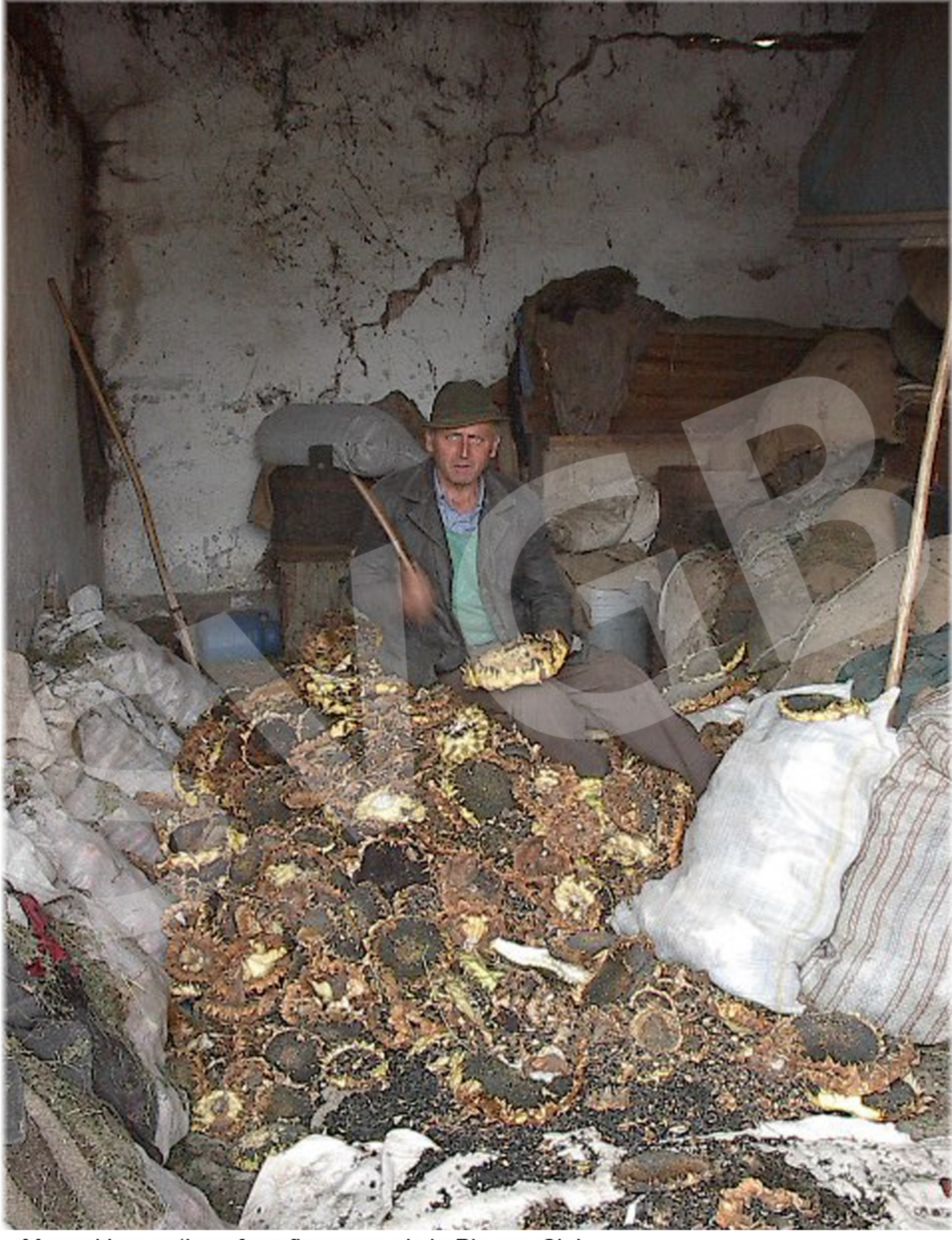
Manual harvesting of sunflower seeds in Pleşca, Cluj