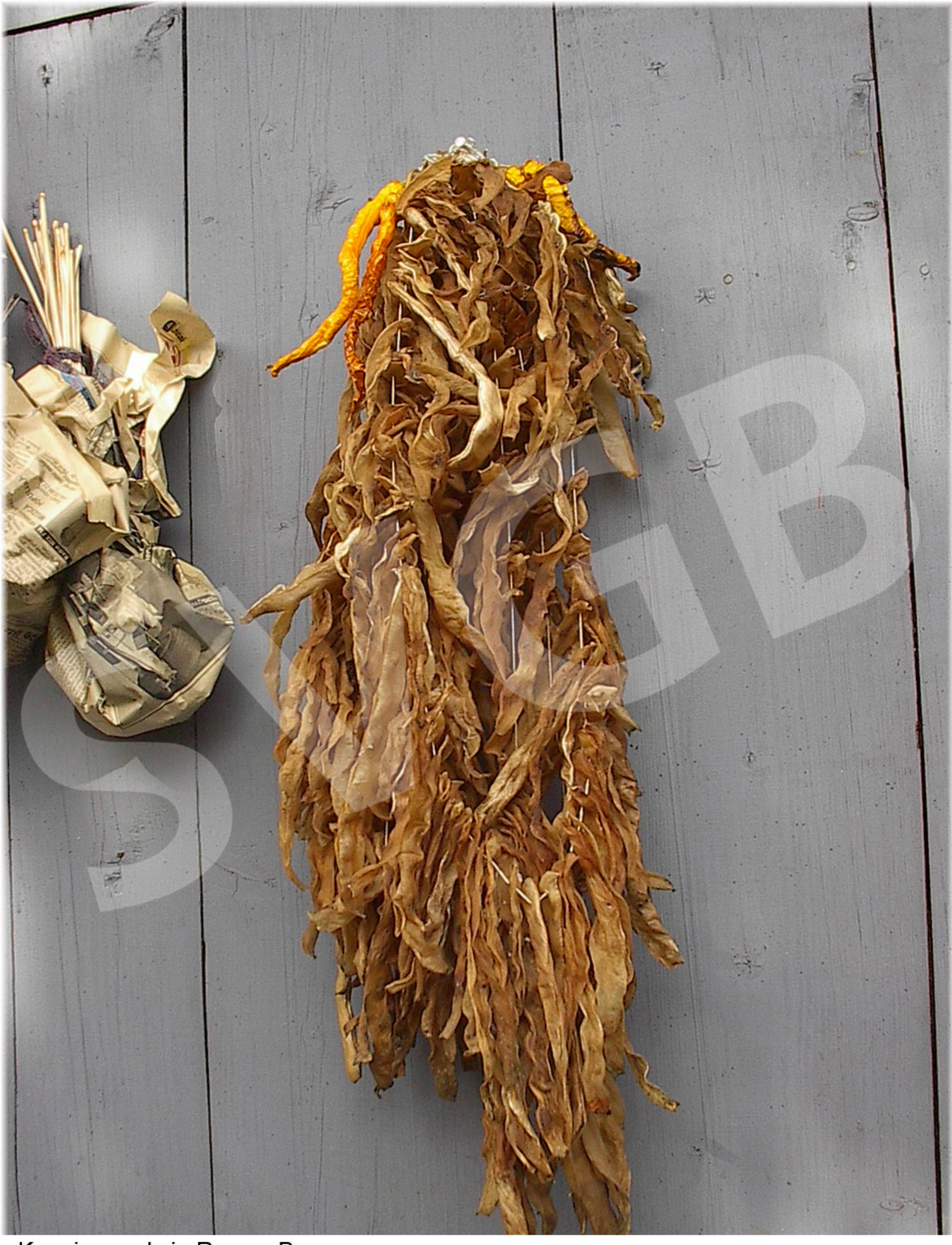
Keeping pods in Recea, Braşov