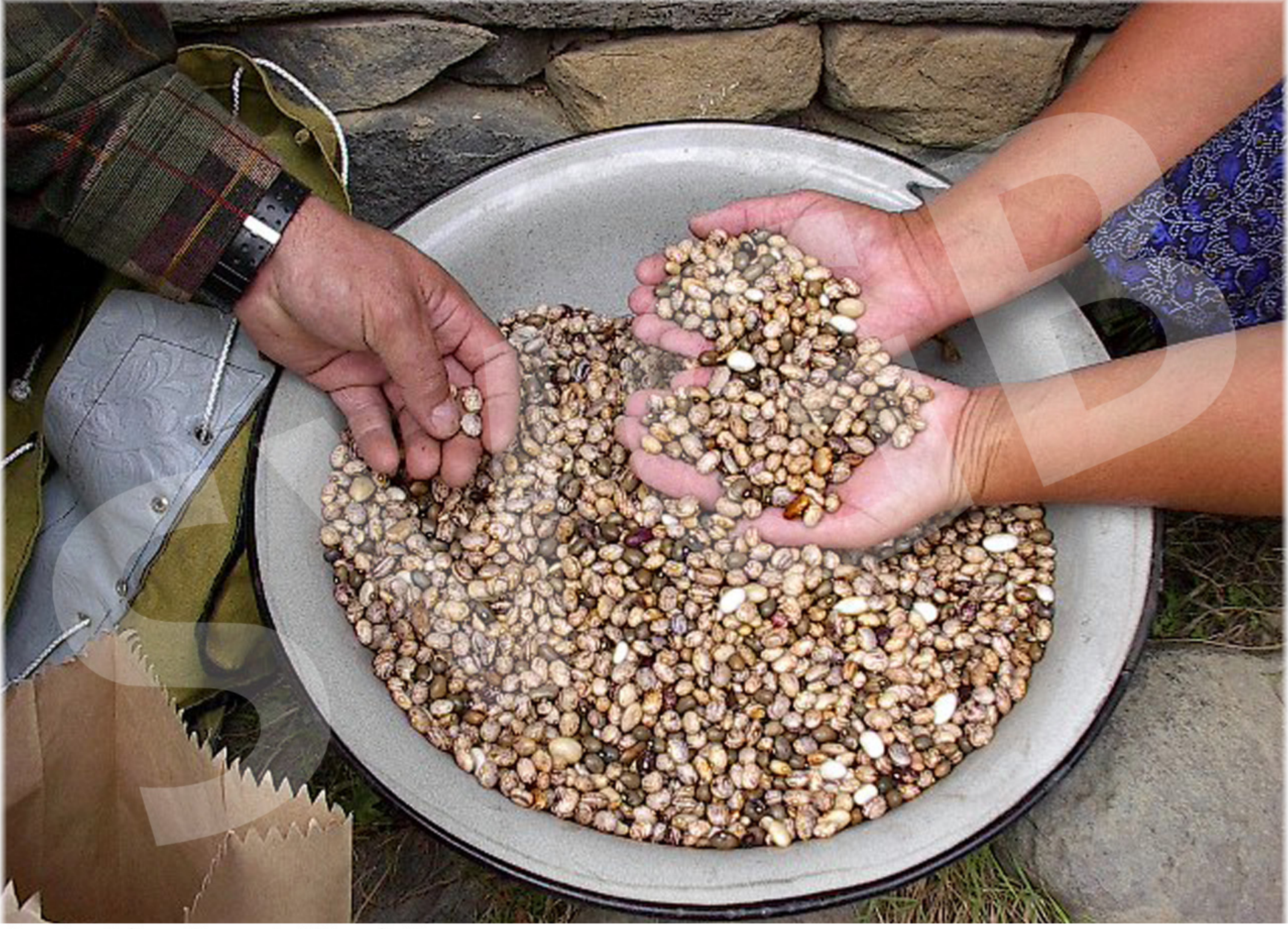
Local varieties of beans in Călineşti, Maramureş