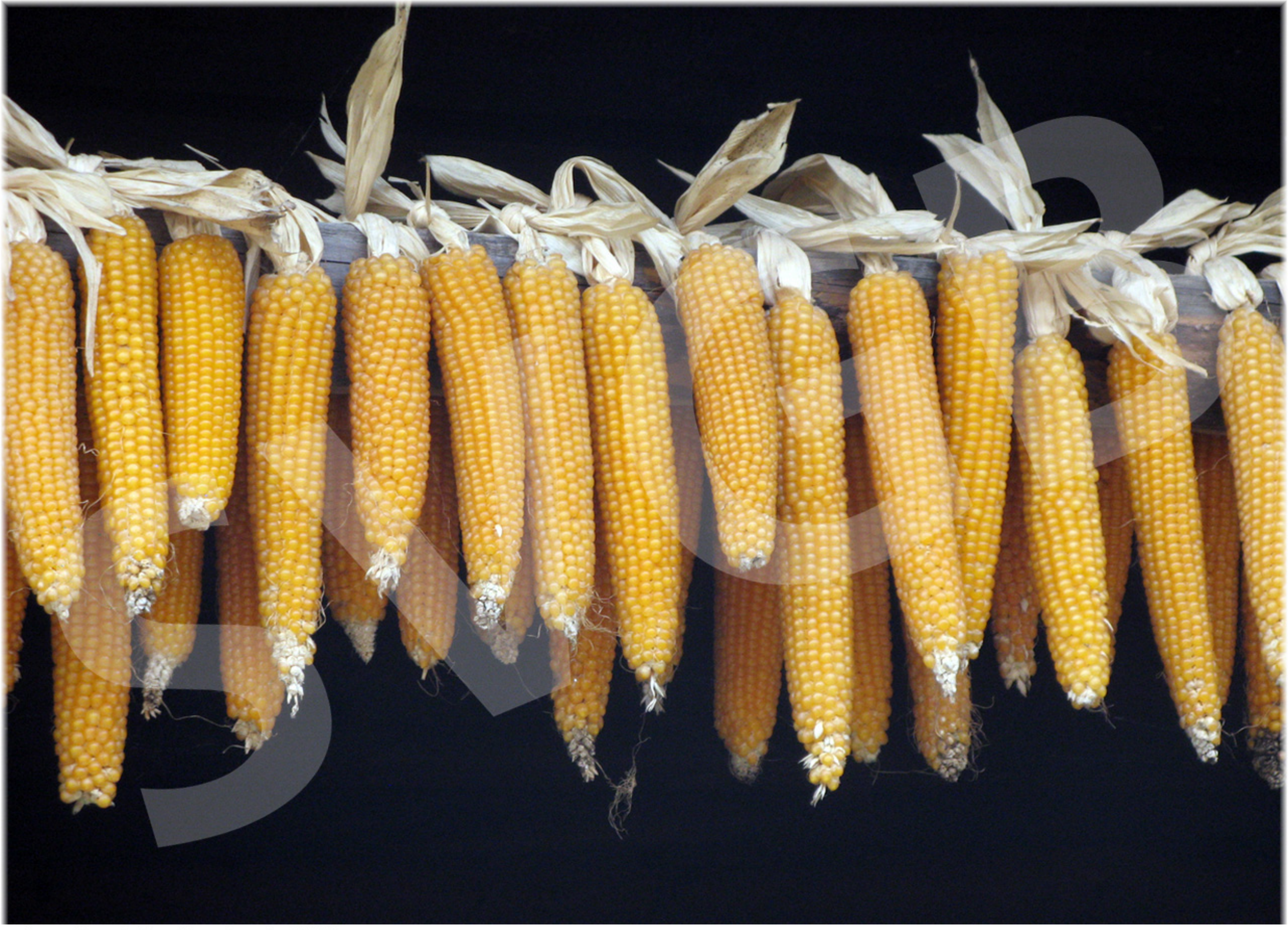
Local variety of maize in Sibiu