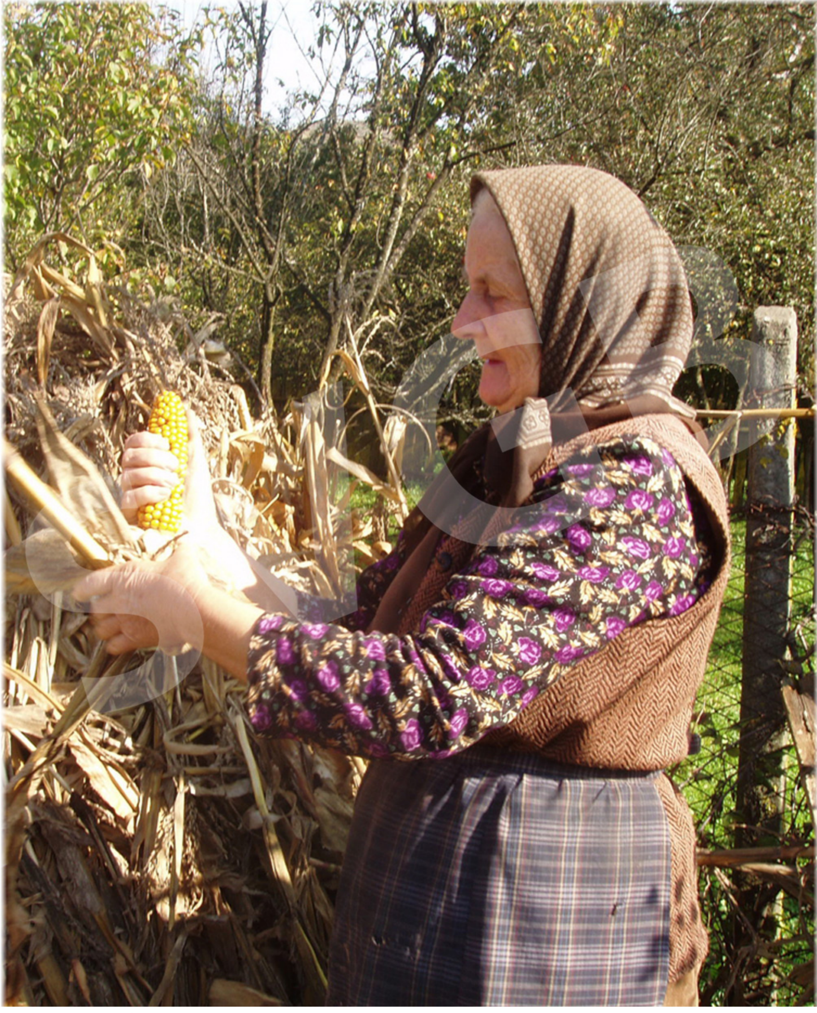
Maize harvesting in Băişoara, Cluj